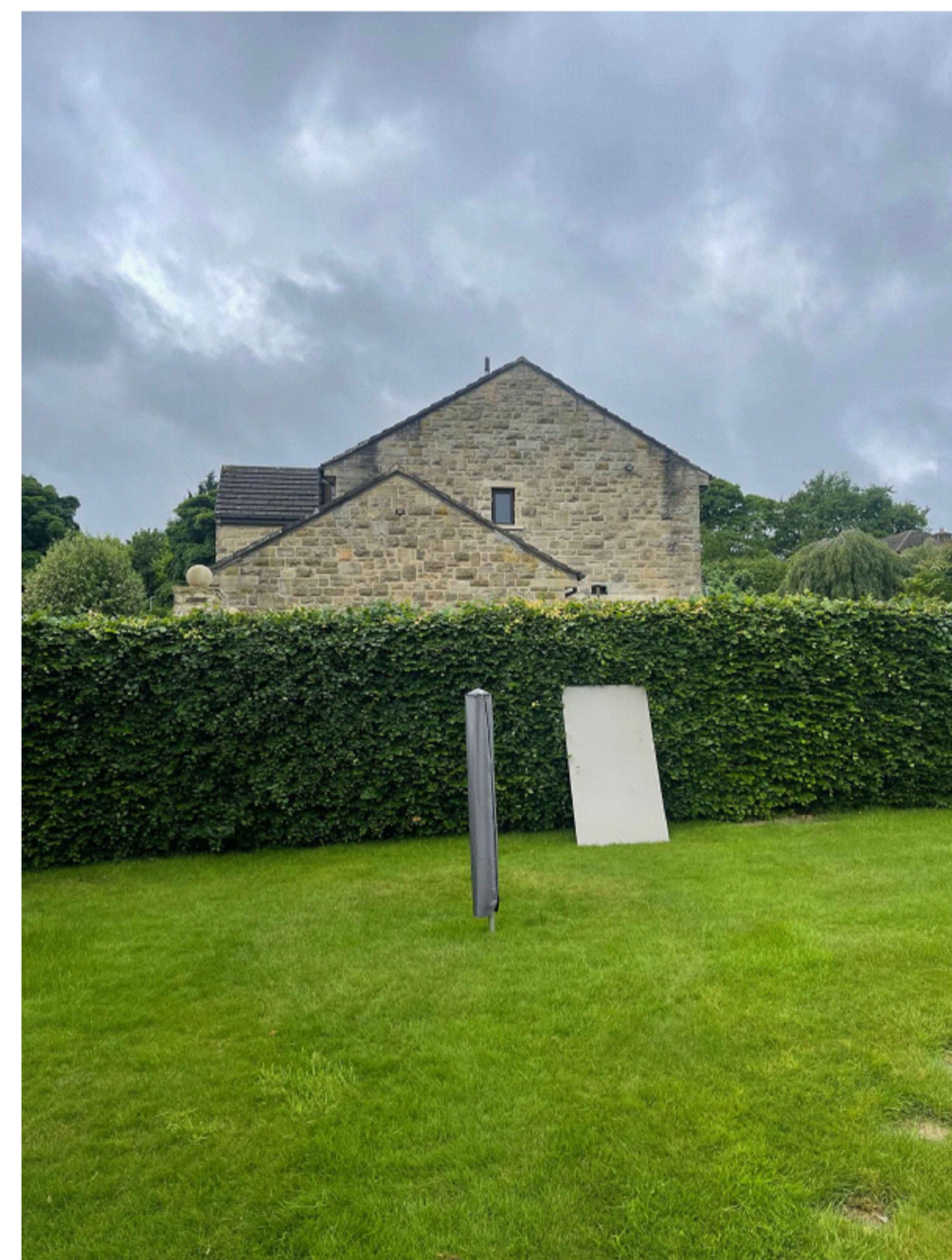
VIEW FROM 17 INGLEWOOD AVENUE GARDEN TO 24 INGLEWOOD AVE.