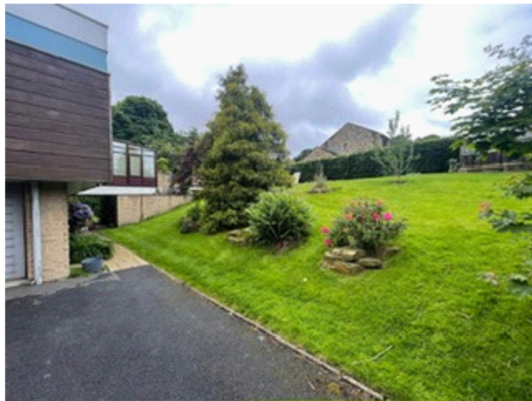
VIEW FROM 17 INGLEWOOD AVENUE DRIVE TO 24 INGLEWOOD AVE.