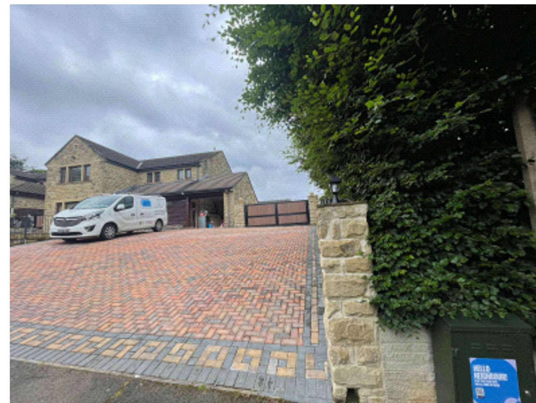
VIEW FROM STREET TO 24 INGLEWOOD AVE.