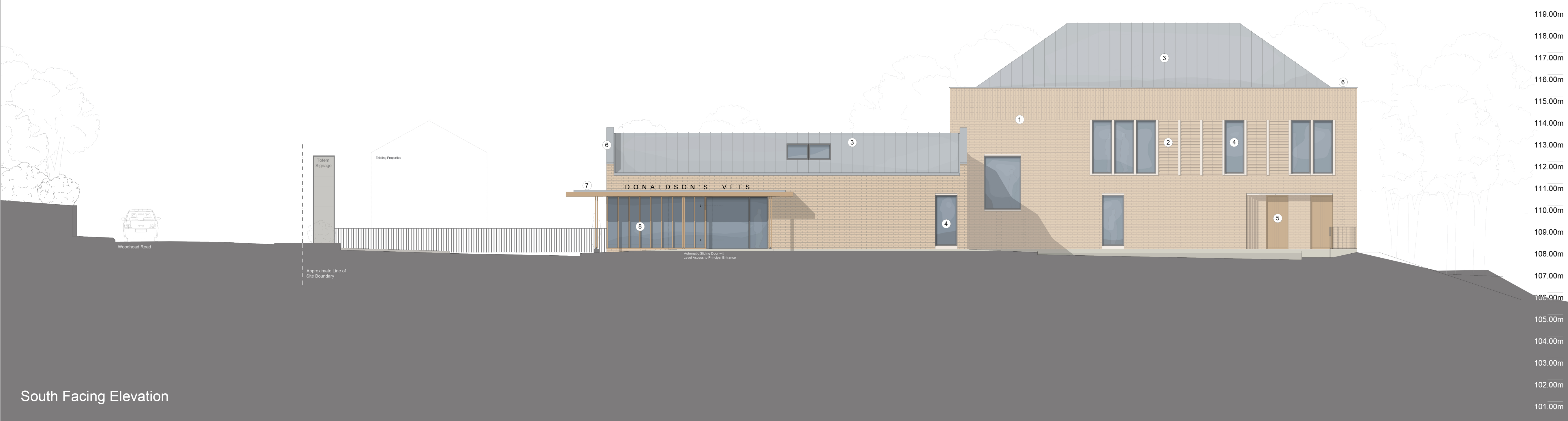
South Facing Elevation