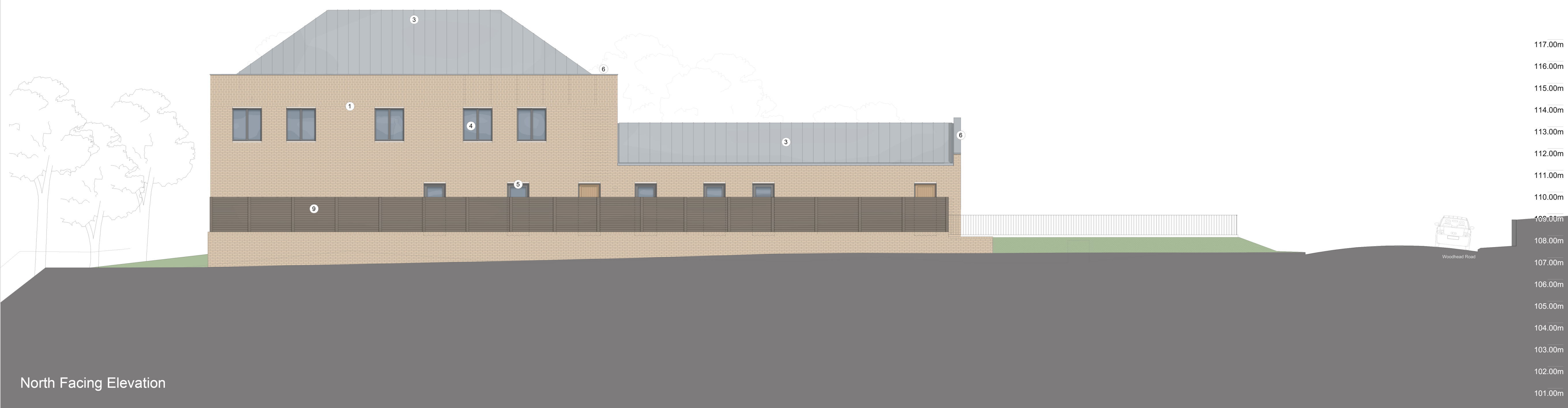
North Facing Elevation