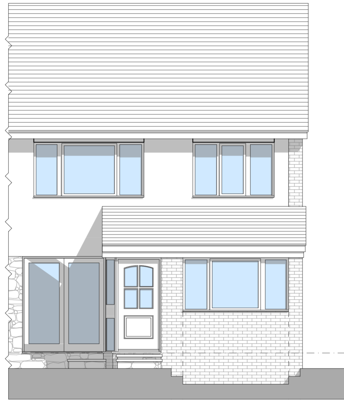
E-01 Front Elevation 1:50