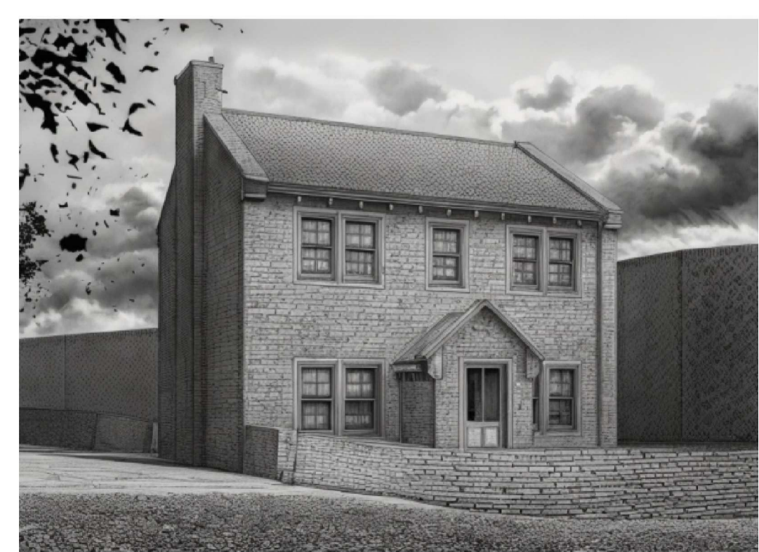
Artist's Impression - Front Elevation