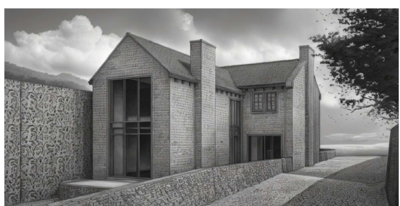
Artist's Impression - Rear Elevation