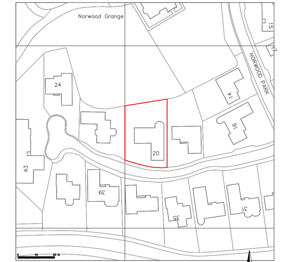
Location Plan. Scale 1:1250.

THIS DRAWING IS THE PROPERTY OF PAD ARCHITECTURE. IT MUST NOT BE COPIED OR REPRODUCED IN ANY WAY WITHOUT THE PRIOR PERMISSION OF THE OWNERS OR THEIR DULY AUTHORISED REPRESENTATIVE