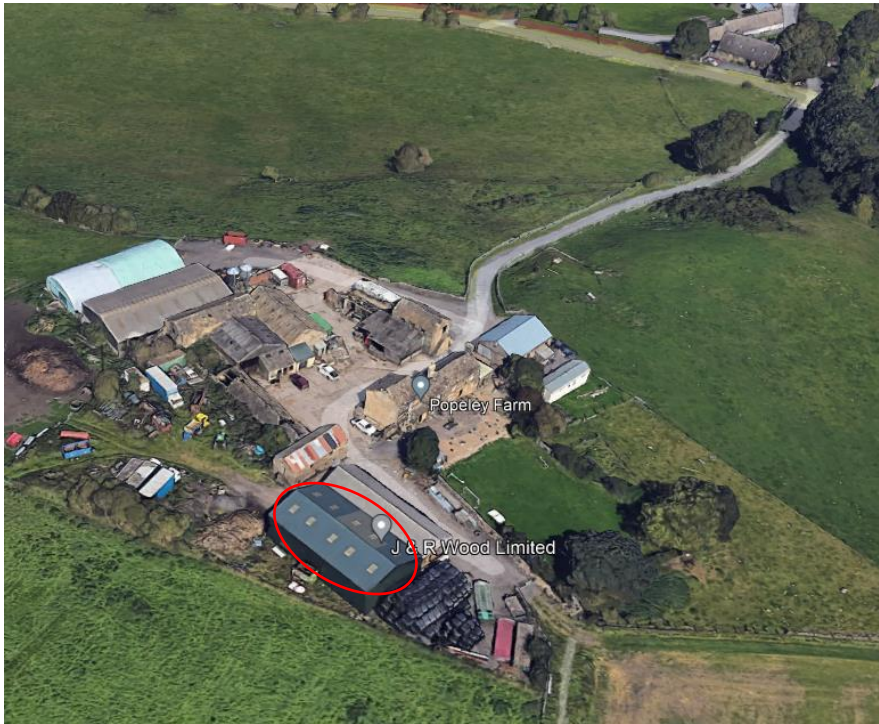
Figure 2: Aerial image showing agricultural building (circled).