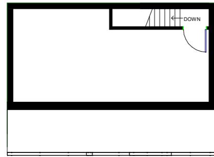
Existing Loft Plan