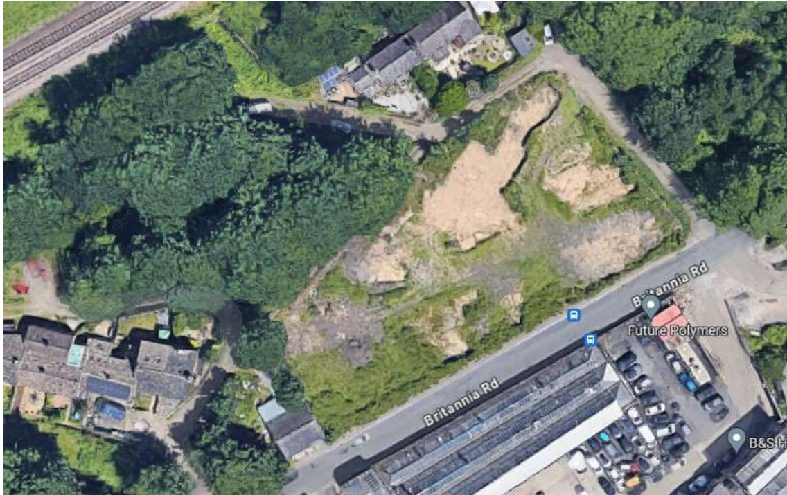
Discharge of Conditions – APPENDIX L (materials – stone detailing and roof) Land Off, Britannia Road, Golcar HD3 4QB