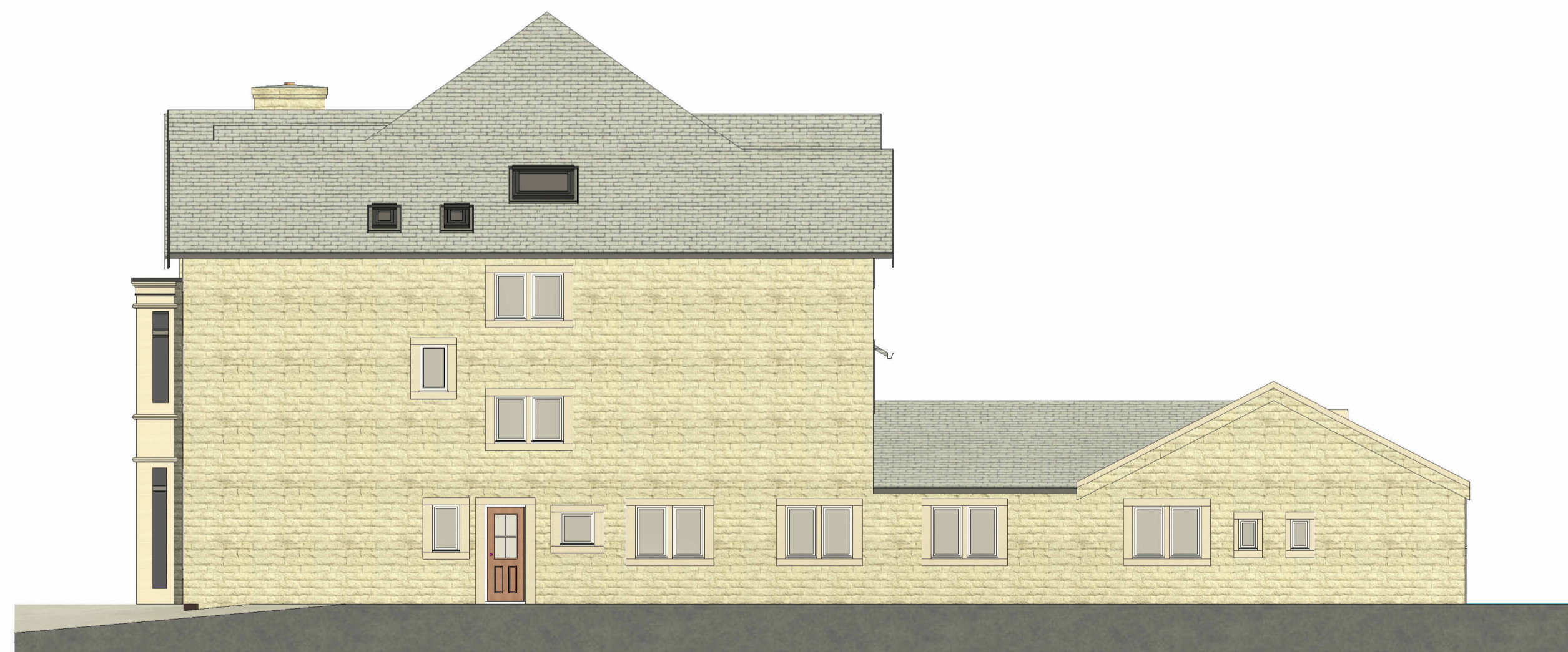
2 South Elevation 1 : 100