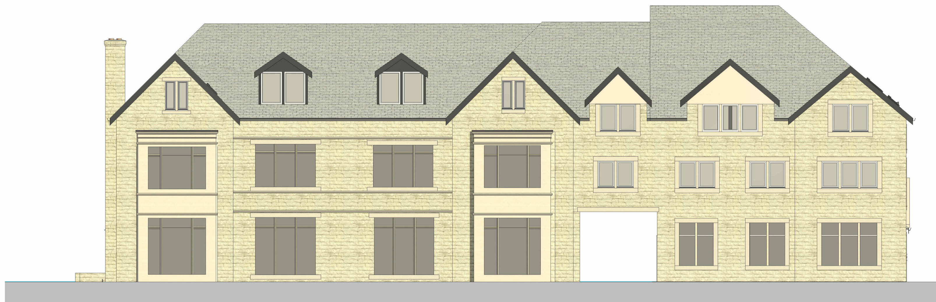
2 East Elevation 1 : 100