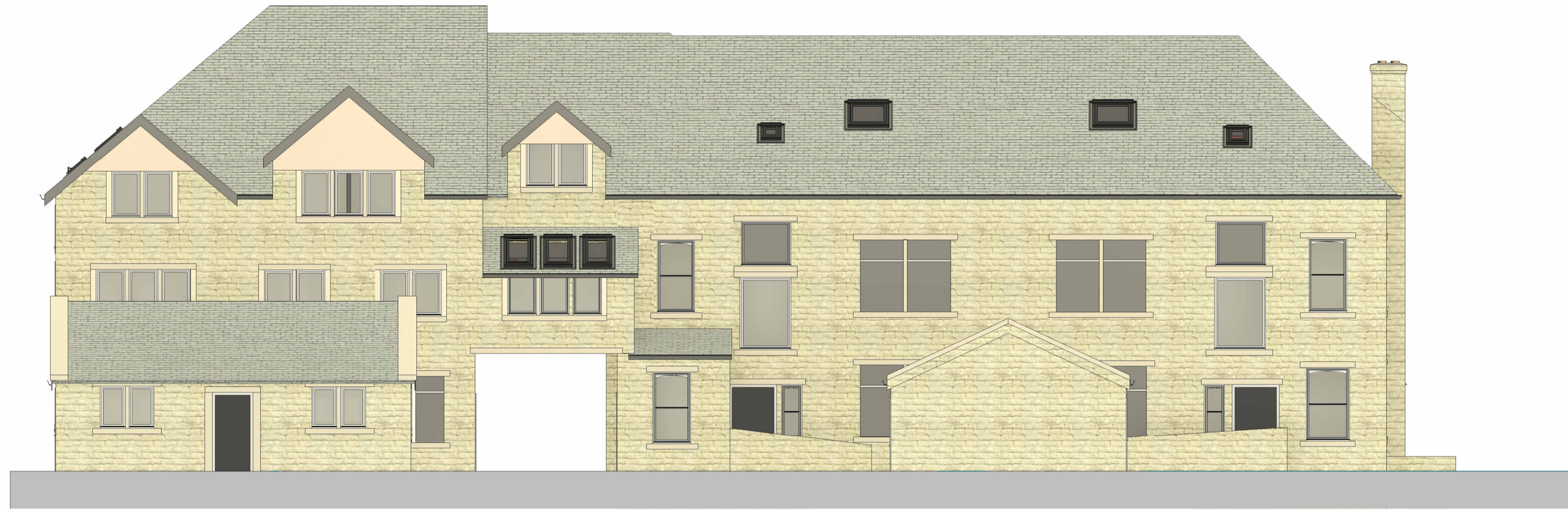
1 West Elevation 1 : 100

Only figured dimensions should be used. Scaled dimensions should be checked with the Architect. This drawing together with the design, is the property and copyright of the Architect and must not be reproduced without written permission