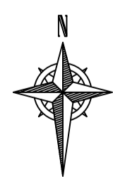
LOCATION PLAN (1:500)