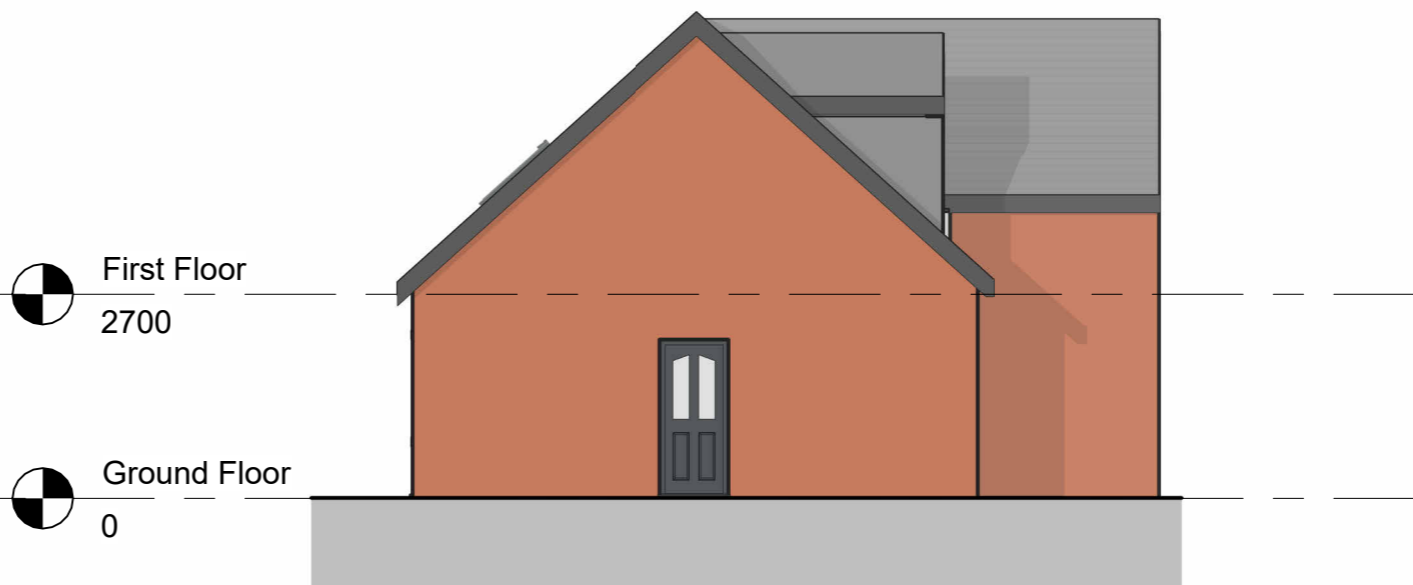
Proposed South Elevation 1 : 100