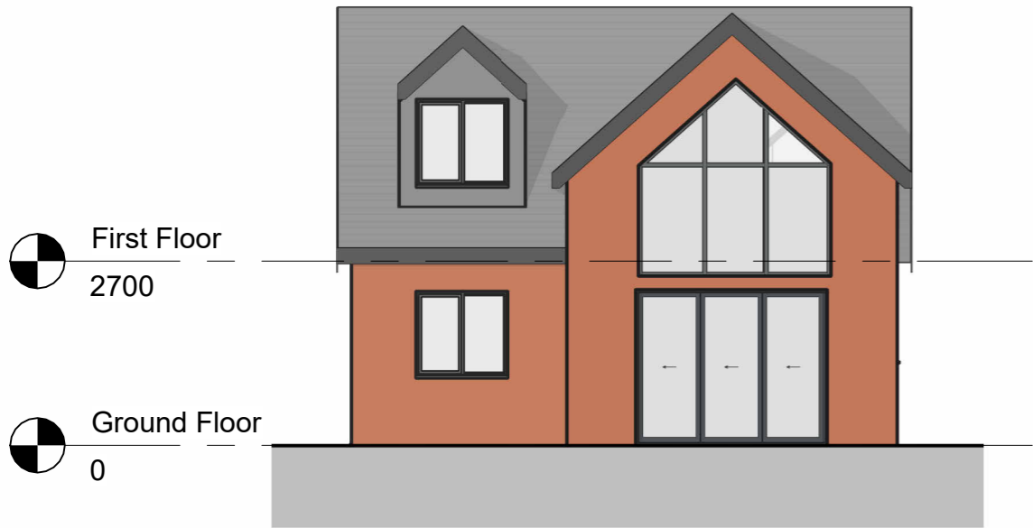
Proposed East Elevation 1 : 100

CLIENT Gill Hinchliffe PROJECT 18 Ullswater Close Hanging Heaton Dewsbury WF12 7PN DRAWING TITLE Proposed Elevations STATUS S4 Proj Ref Origin Zone Level Type Role Num Status Rev 23003 BAS 00 XX DR A 20400 S4 P1 Sheet Scale Issue Date Drwn by Ckd by A3 1 : 100 28-12-23 AB AB