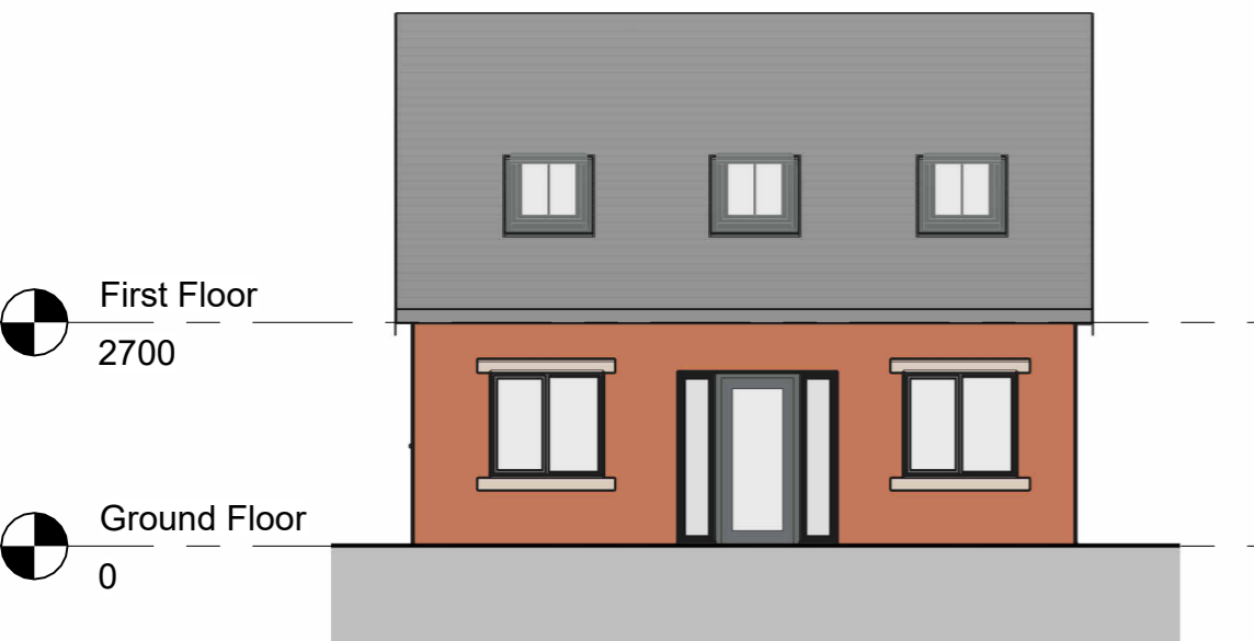
Proposed West Elevation 1 : 100