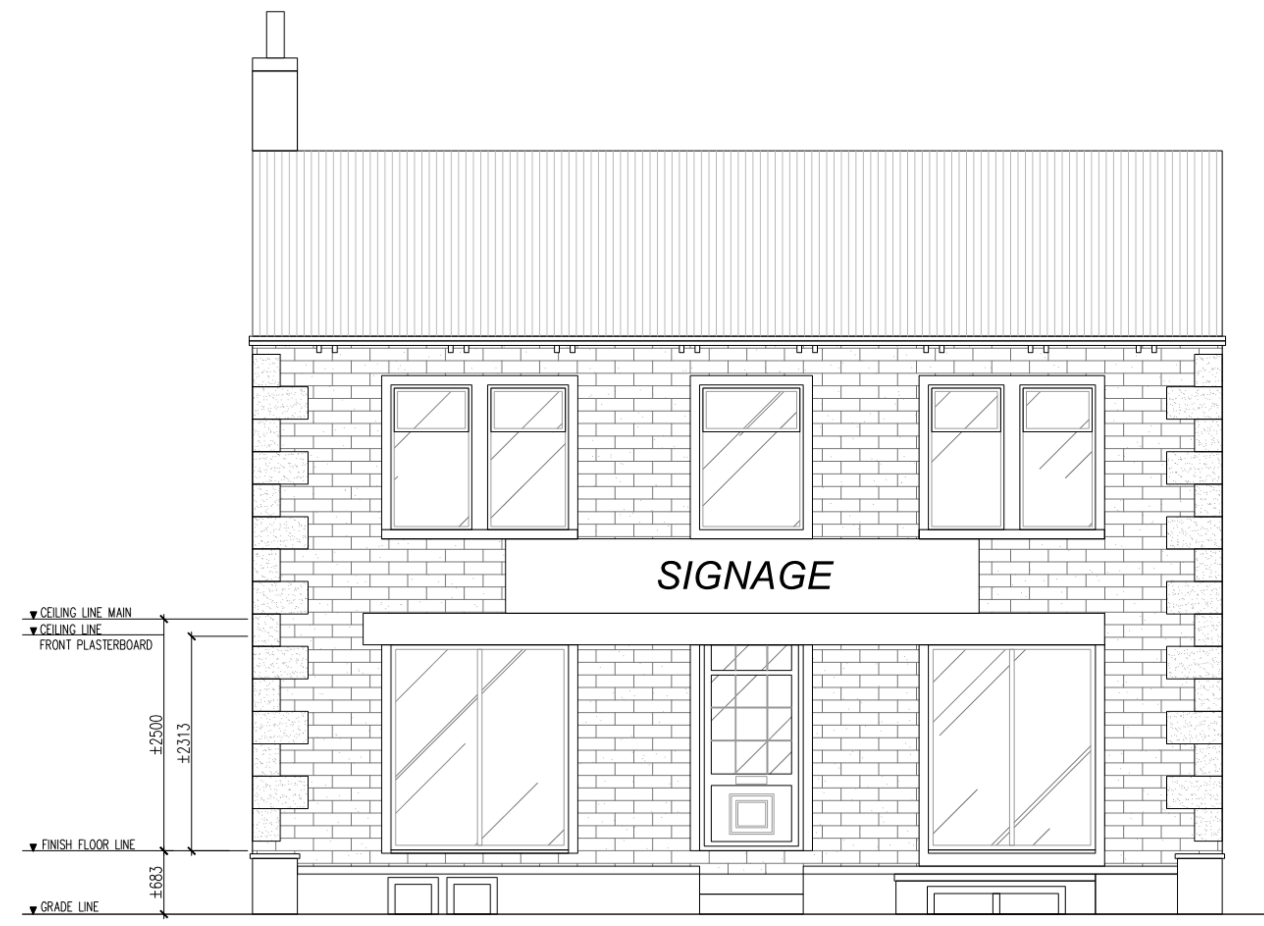
4 EXISTING FACADE ELEVATION Scale 1:40 MTS