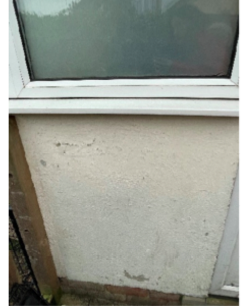
White Render and UPVc