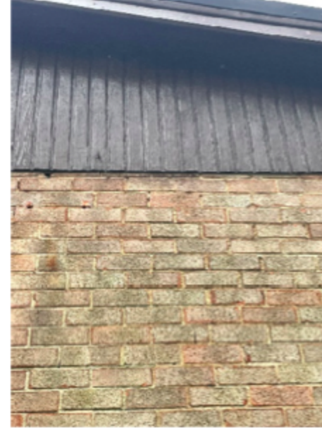
Blackened timber cladding