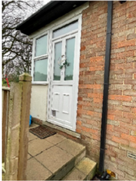
Brown /red mix brick