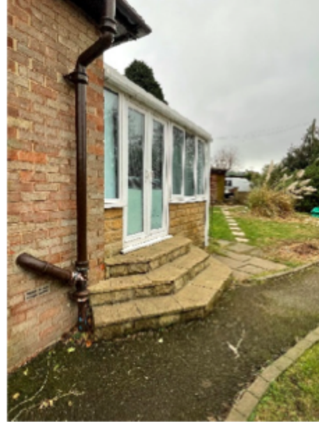
Marshallite stone steps