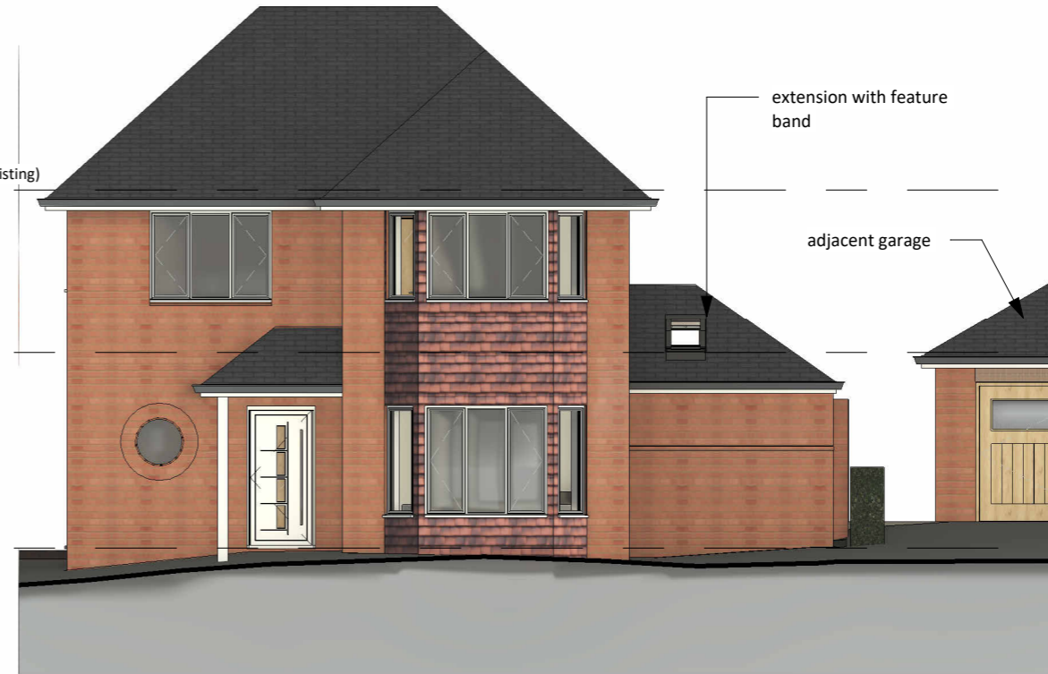
1 03b FF Proposed 1 : 100

▼ Wallplate (existing) 5290 ▼ First Floor 2890 ▼ Ground Floor 0