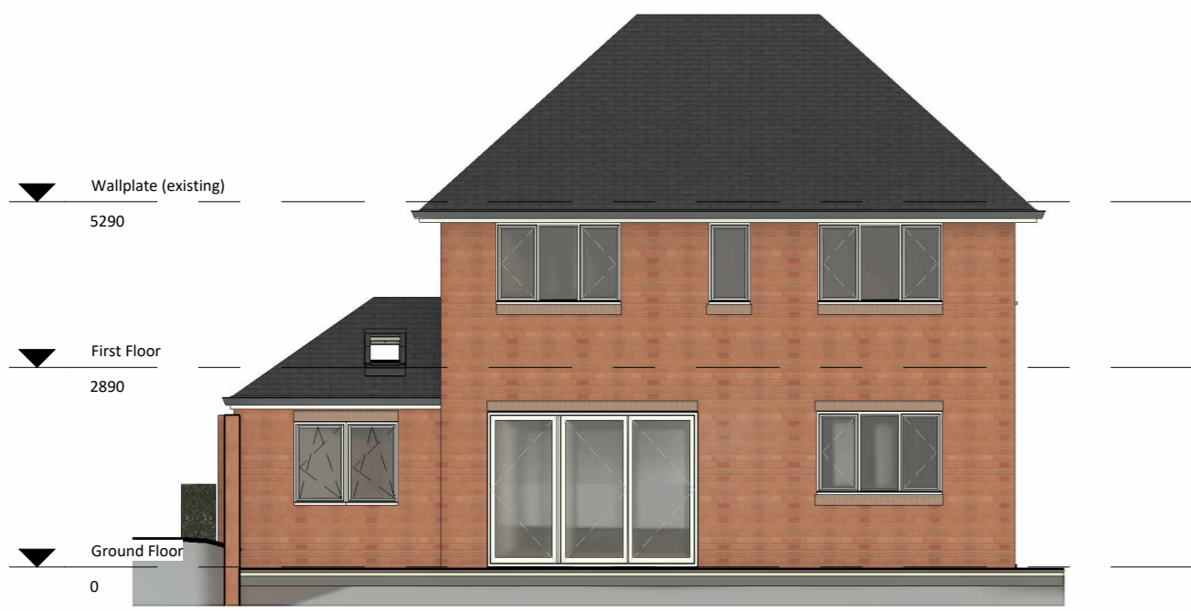
3 11 North Proposed 1 : 100