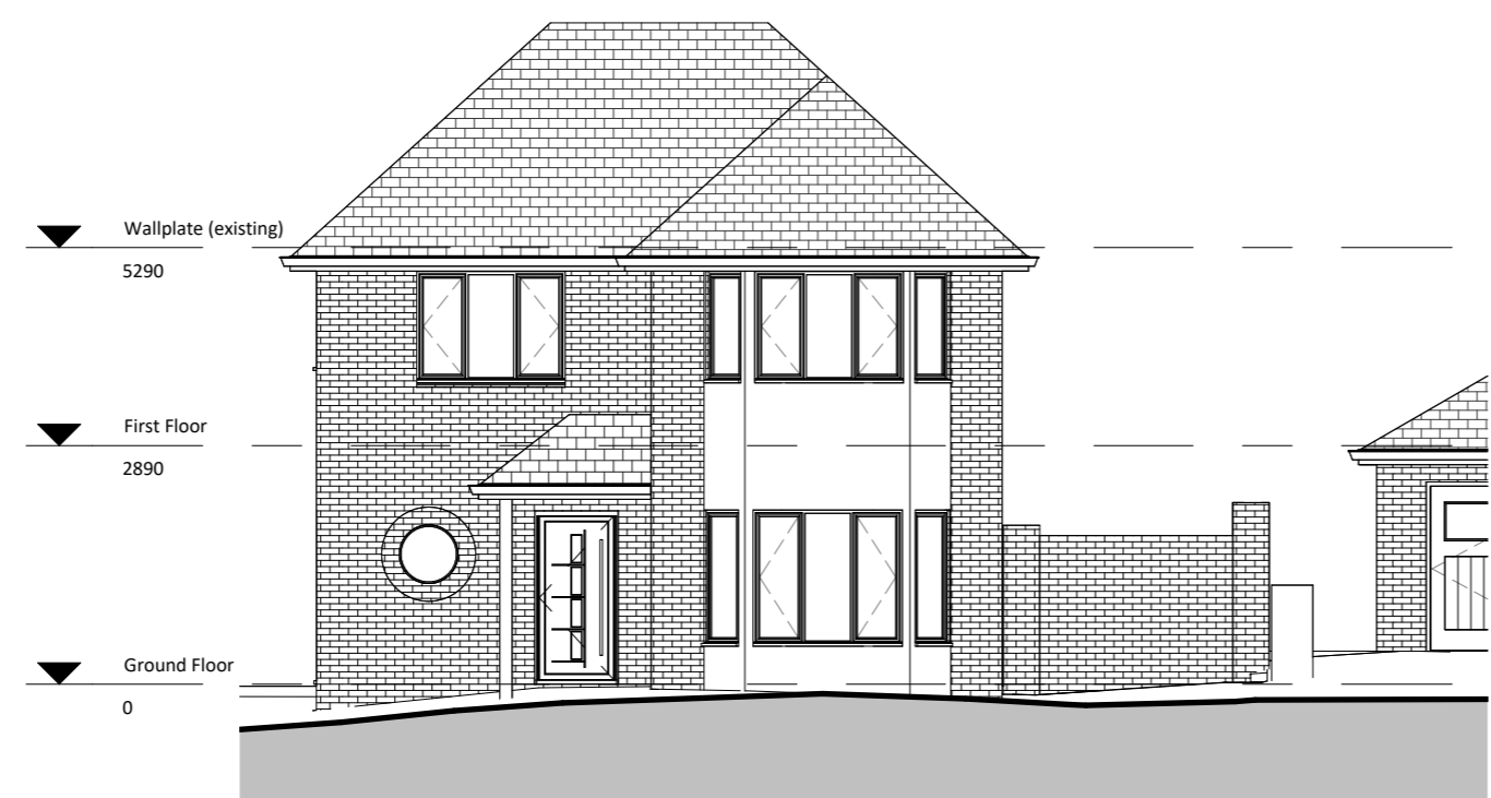
3 10 South Existing 1 : 100