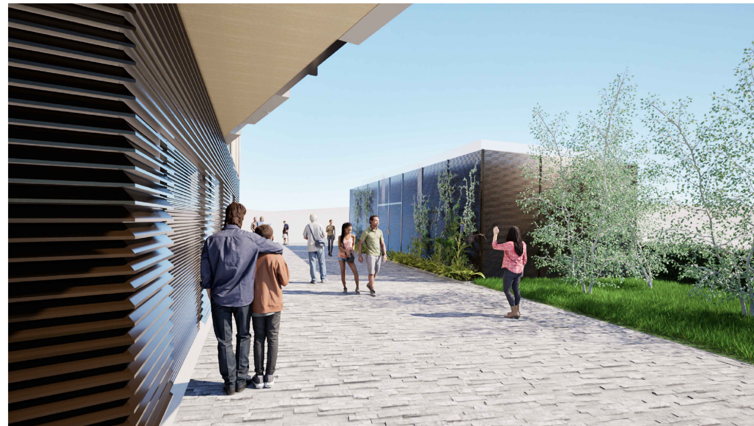
02 0320 SPRINKLER TANK SCREEN - EYE LEVEL VIEW 1 (V1) Scale 1: 50 @A1