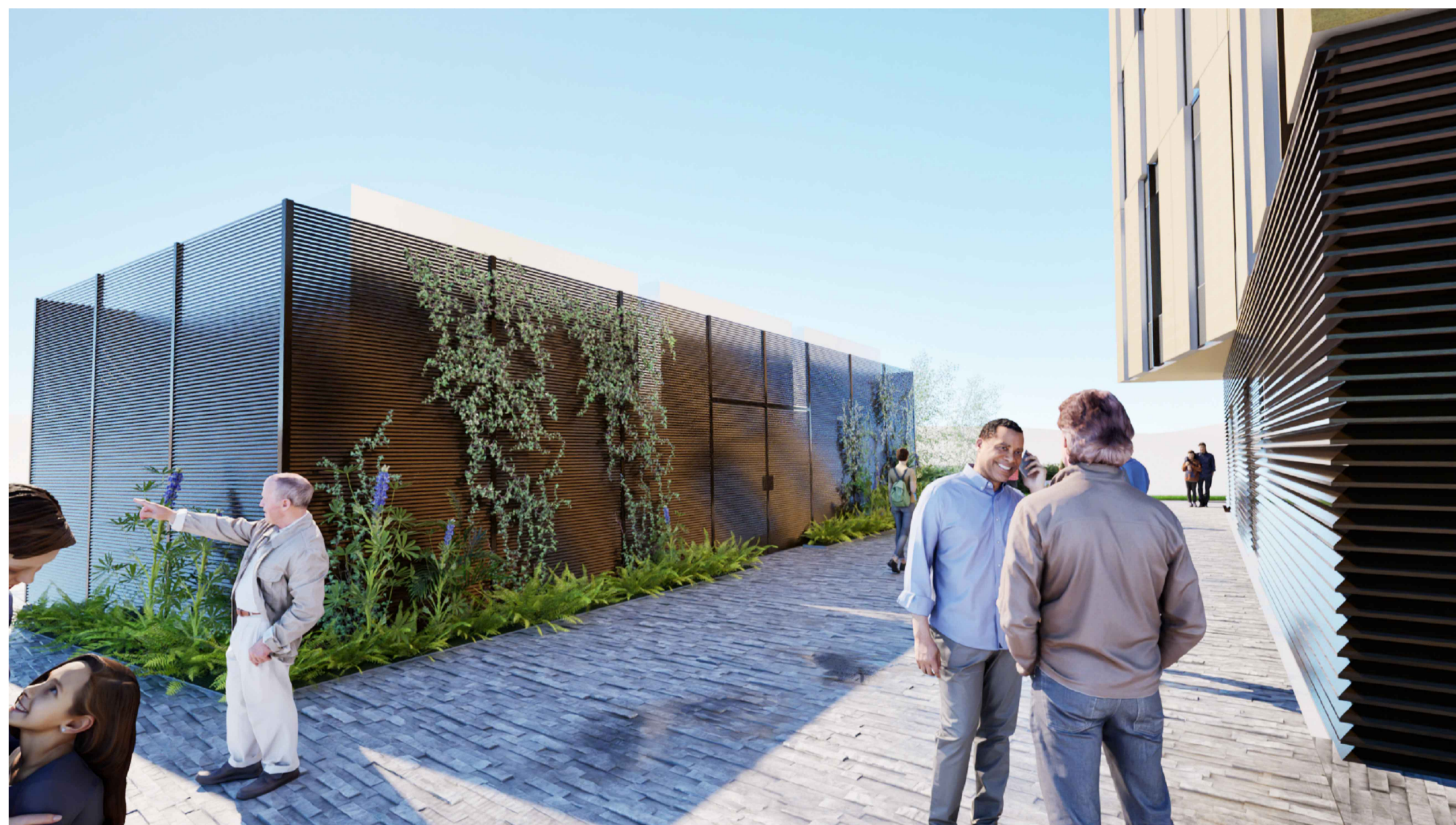
03 0320 SPRINKLER TANK SCREEN - EYE LEVEL VIEW 2 (V2) Scale 1: 50 @A1