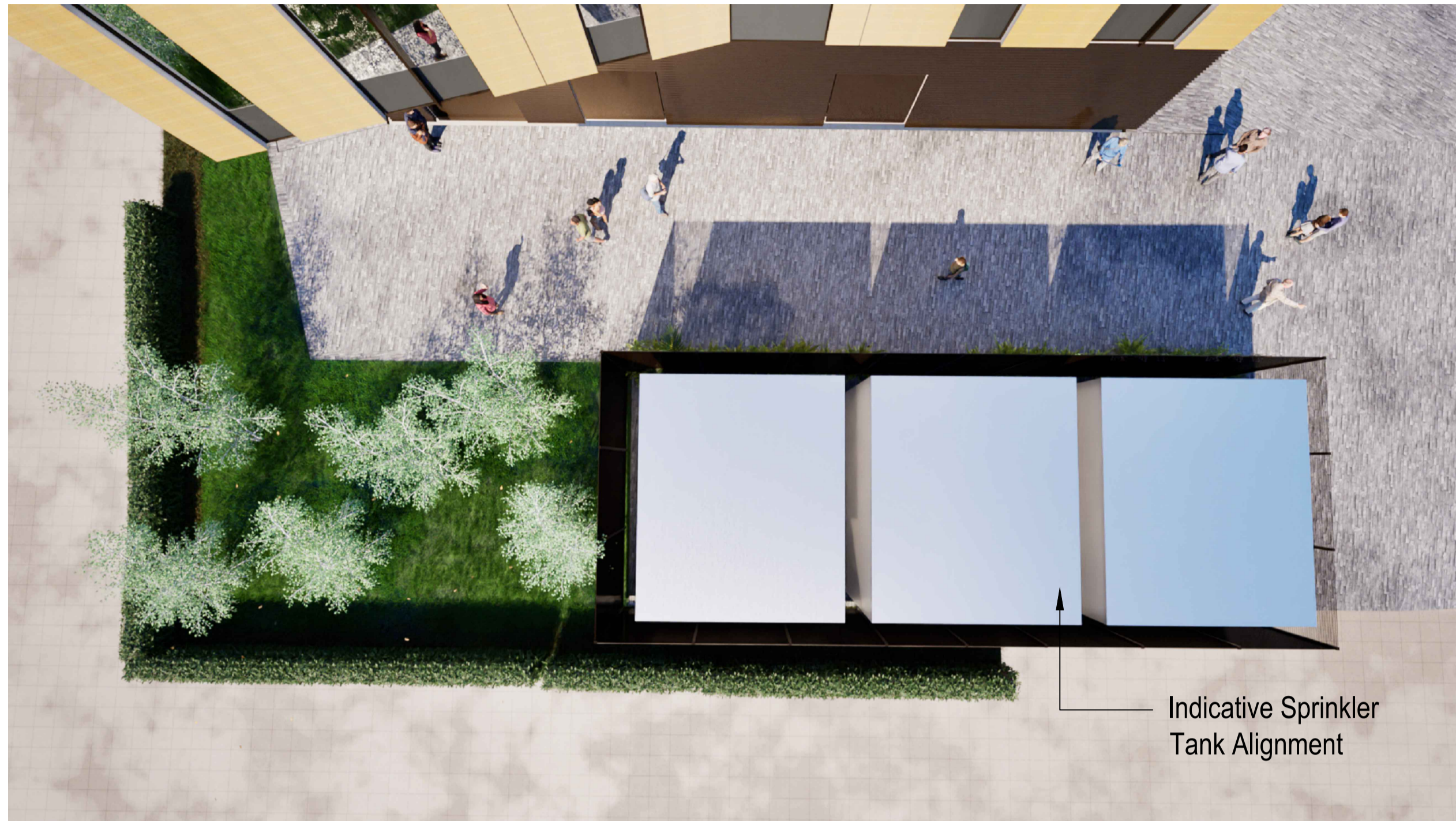
01 0320 SPRINKLER TANK SCREEN - PLAN VIEW Scale 1: 50 @A1