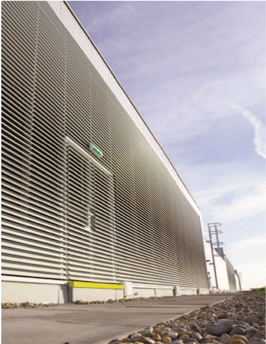
03 0319 SPRINKLER TANK SCREEN - METAL LOUVRES Scale 1: 50 @A1