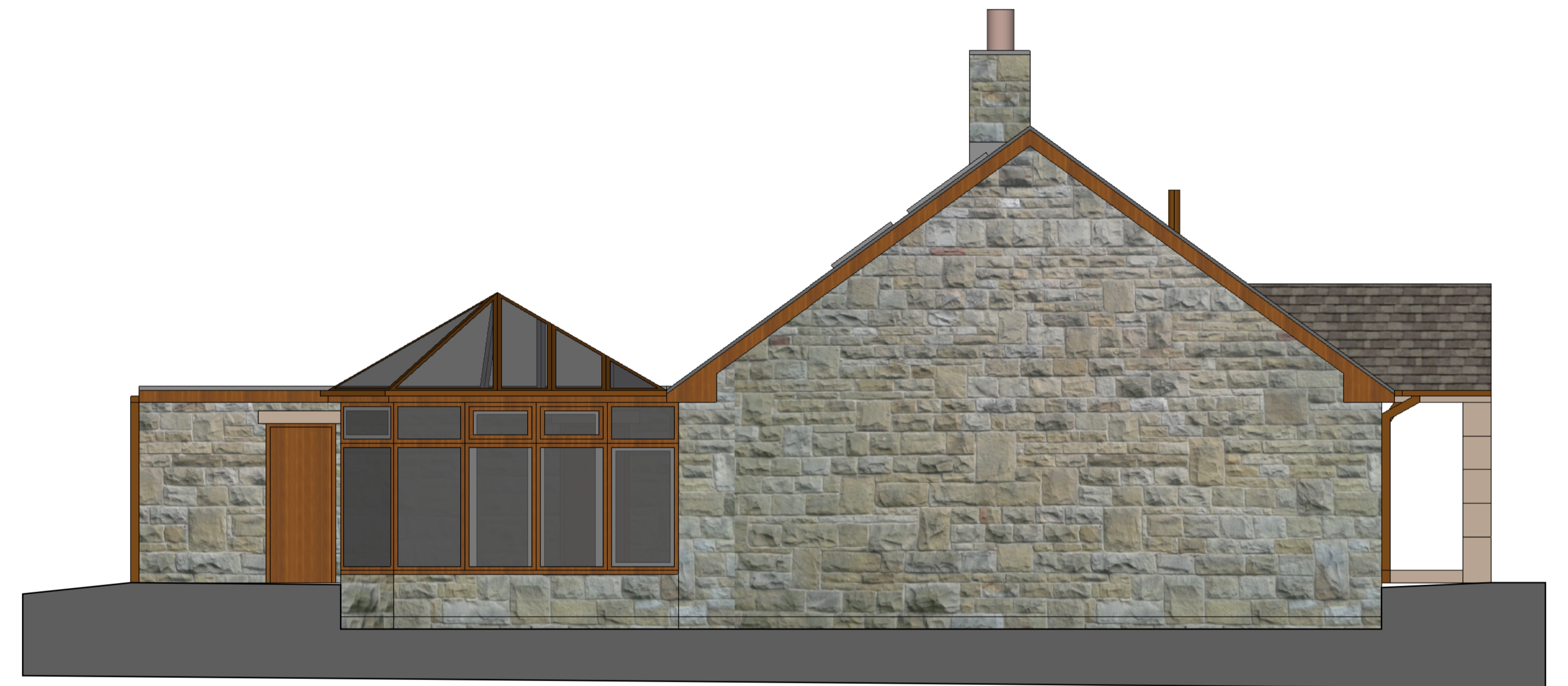
Existing West elevation