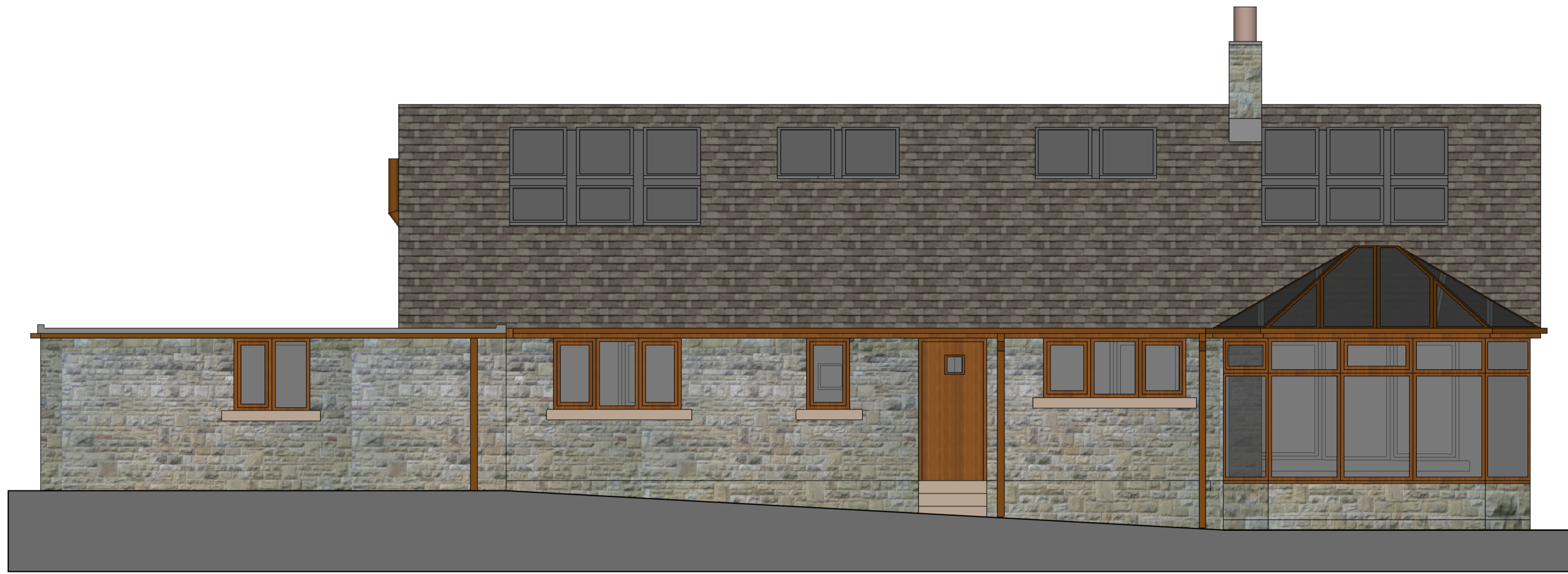
Existing South elevation