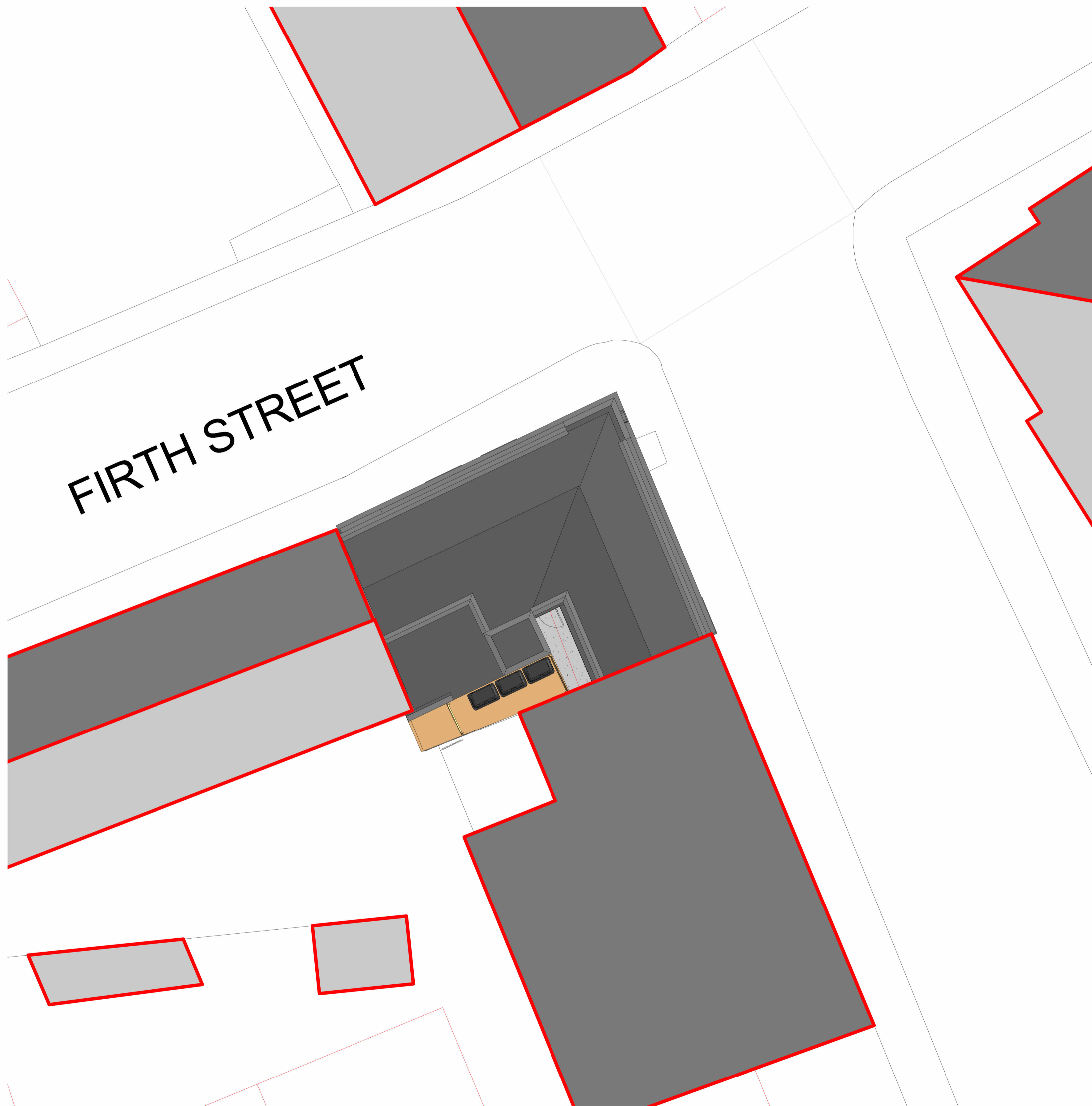
1 PROPOSED SITE PLAN 1 : 100

Only figured dimensions should be used. Scaled dimensions should be checked with the Architect. This drawing together with the design, is the property and copyright of the Architect and must not be reproduced without written permission