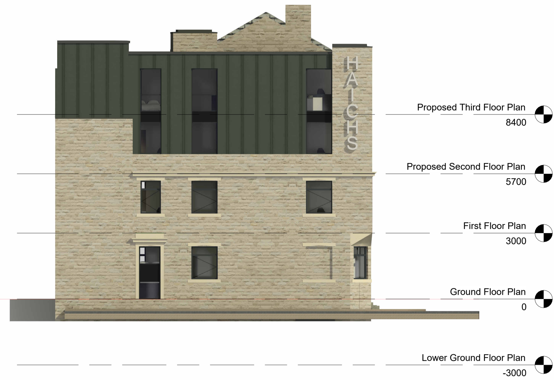
2 West - Side Elevation 1 As Proposed 1:100