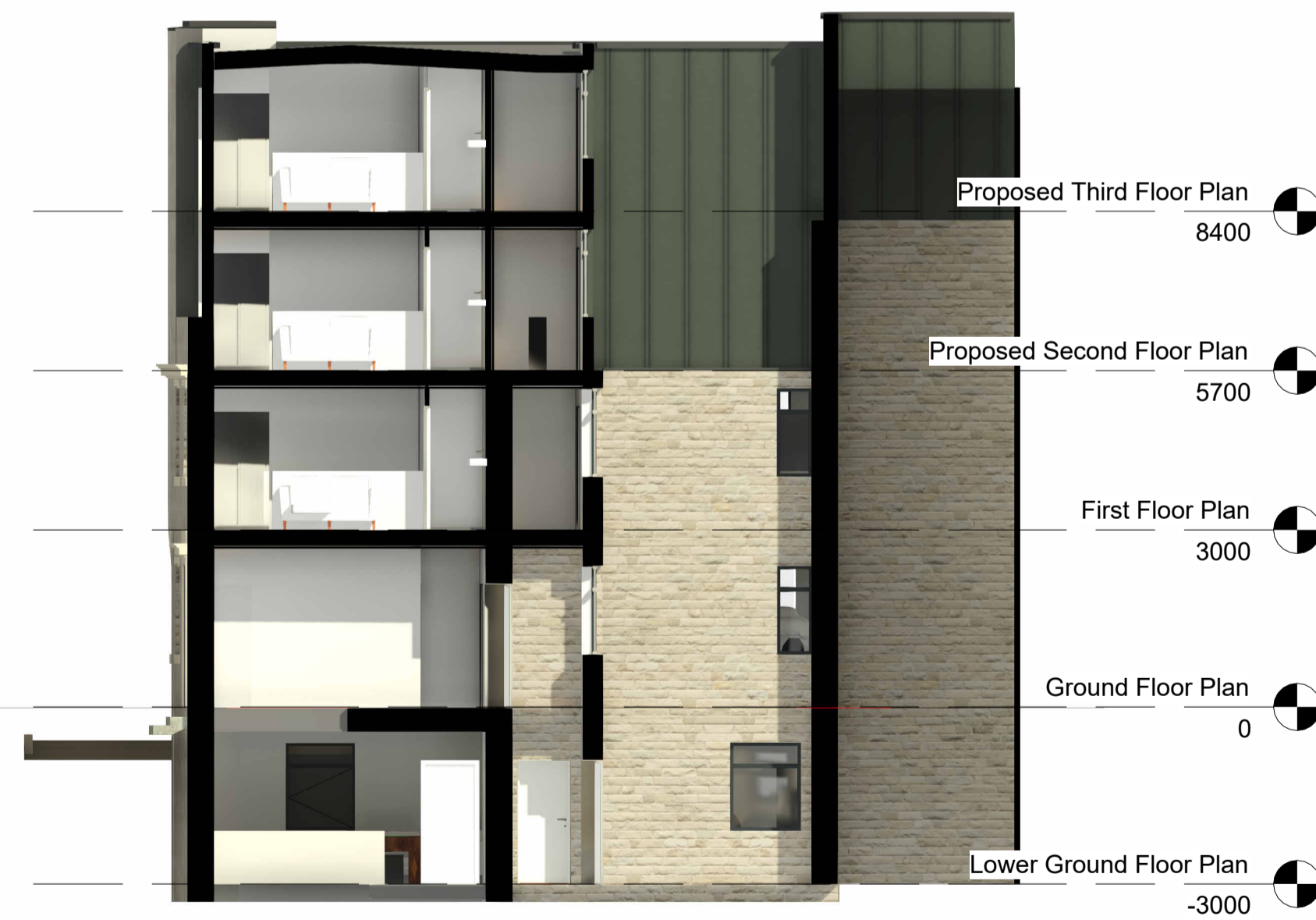
4 East - Side Elevation 2 As Proposed 1:100