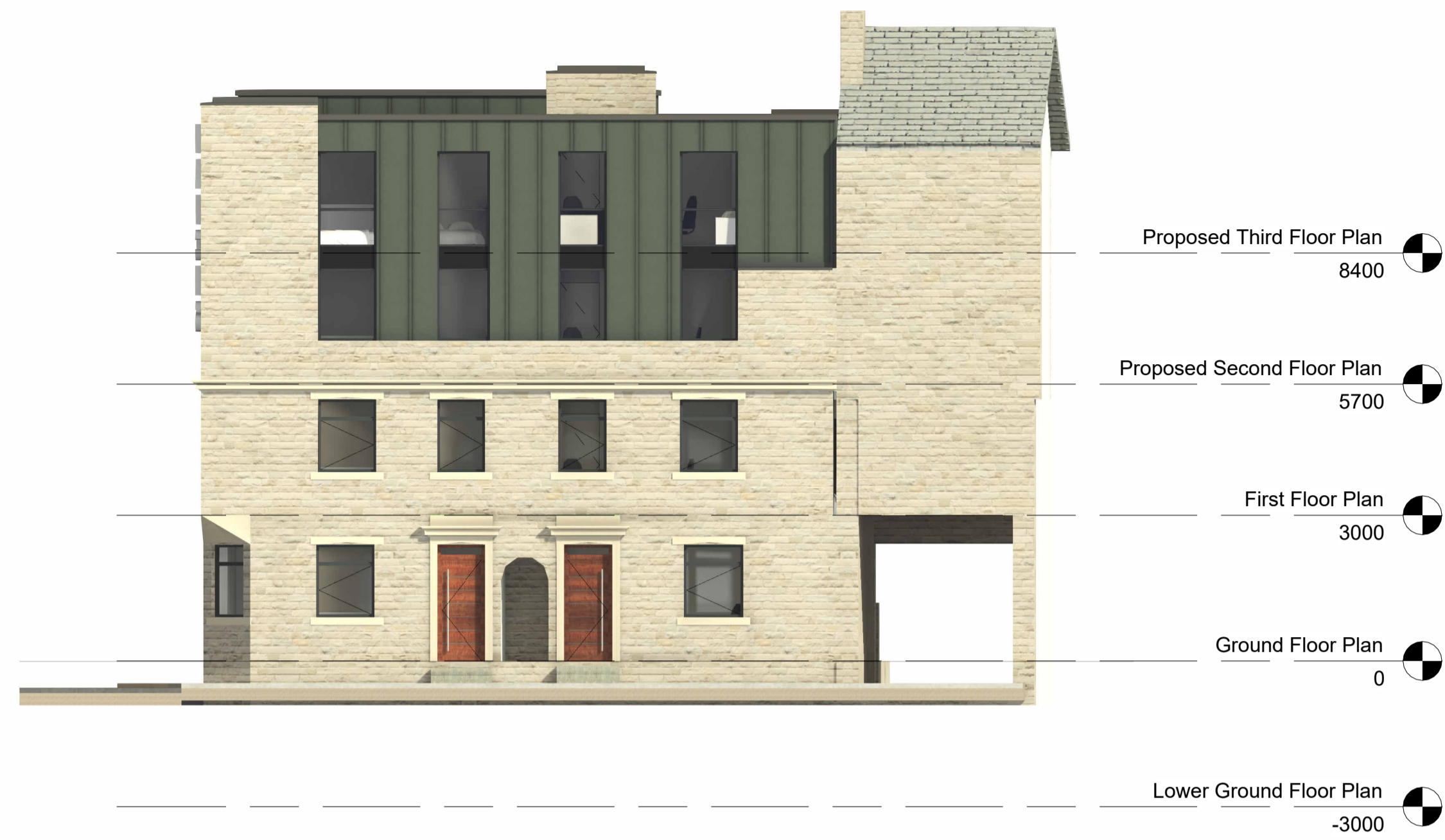
1 South - Front Elevation As Proposed 1:100