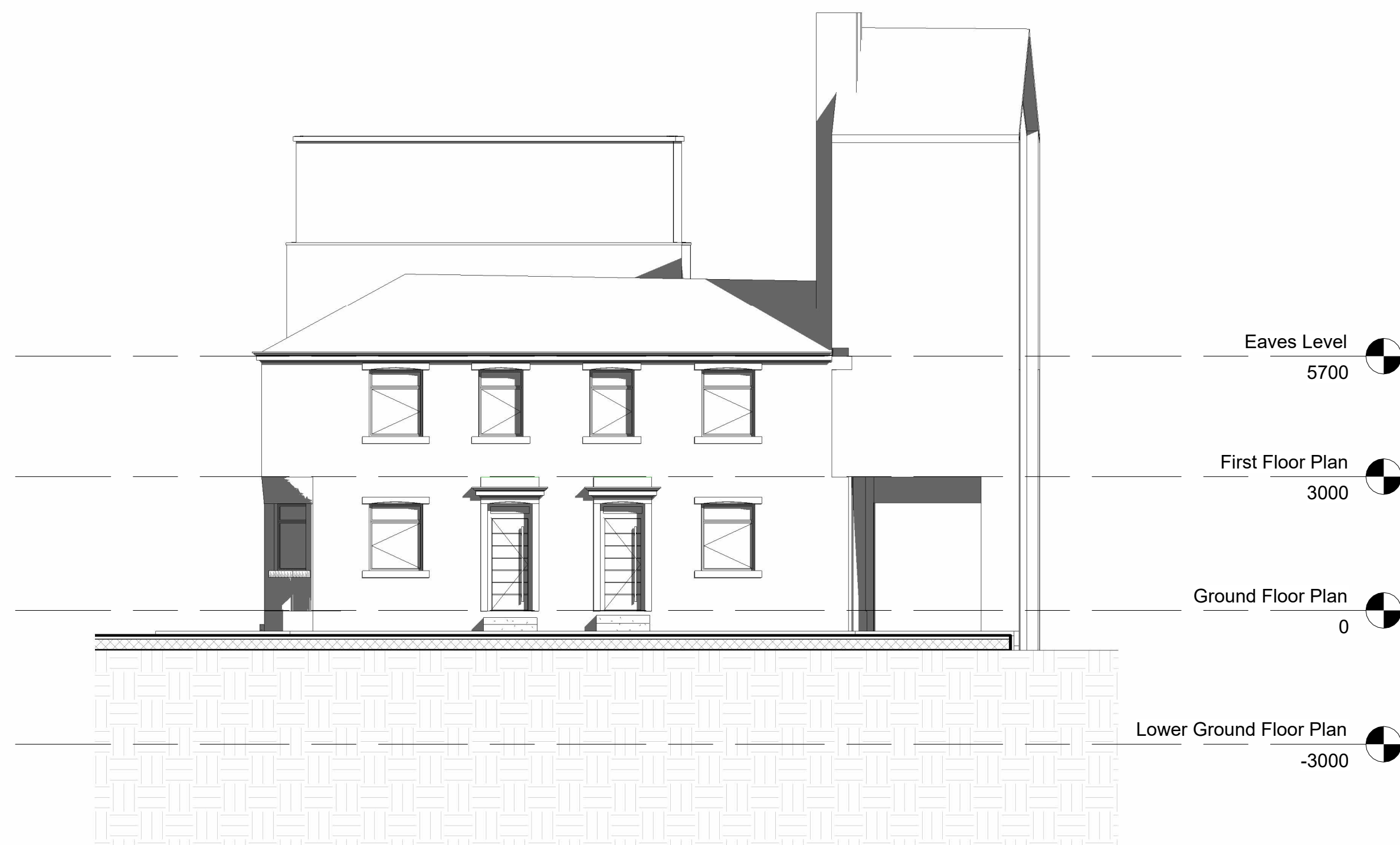
3 South Elevation As Existing 1 : 100