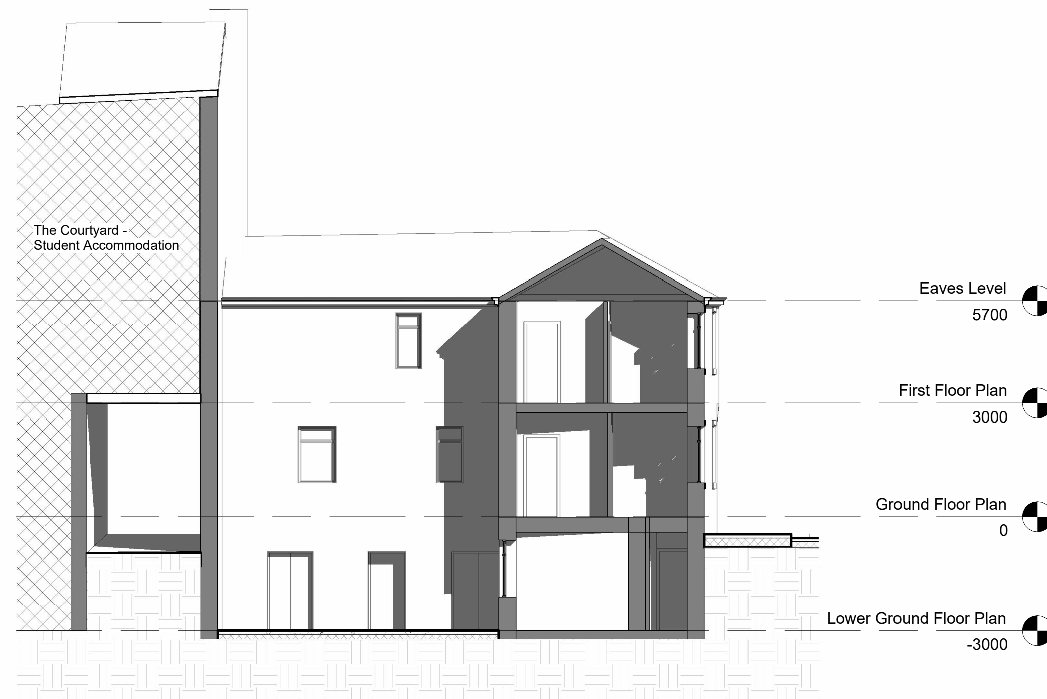
2 North Elevation As Existing 1 : 100