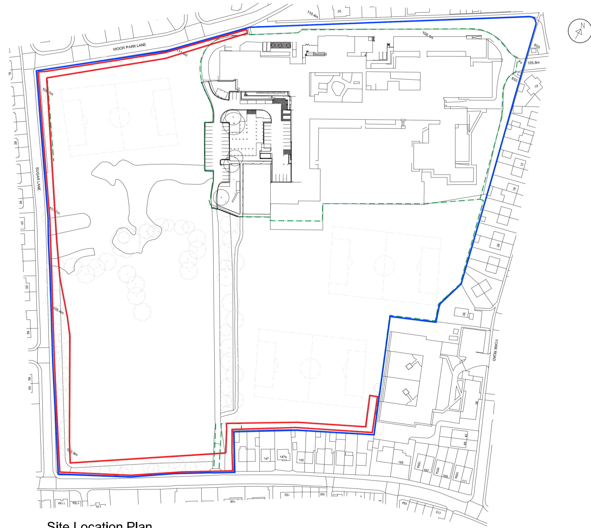
Site Location Plan Scale 1:1250 @ A1