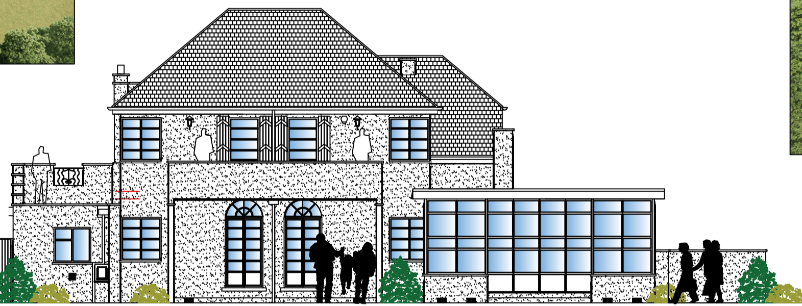
Existing Rear Elevation (East)