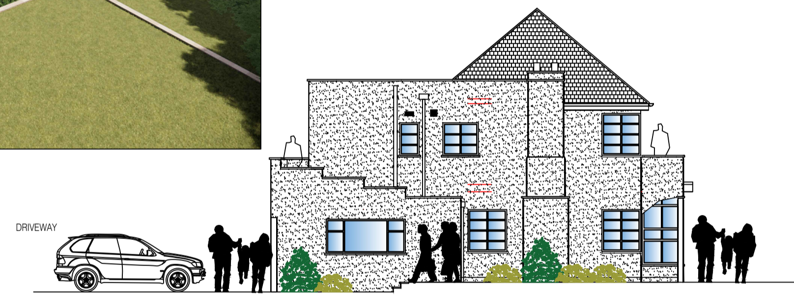
Existing Side Elevation (South)