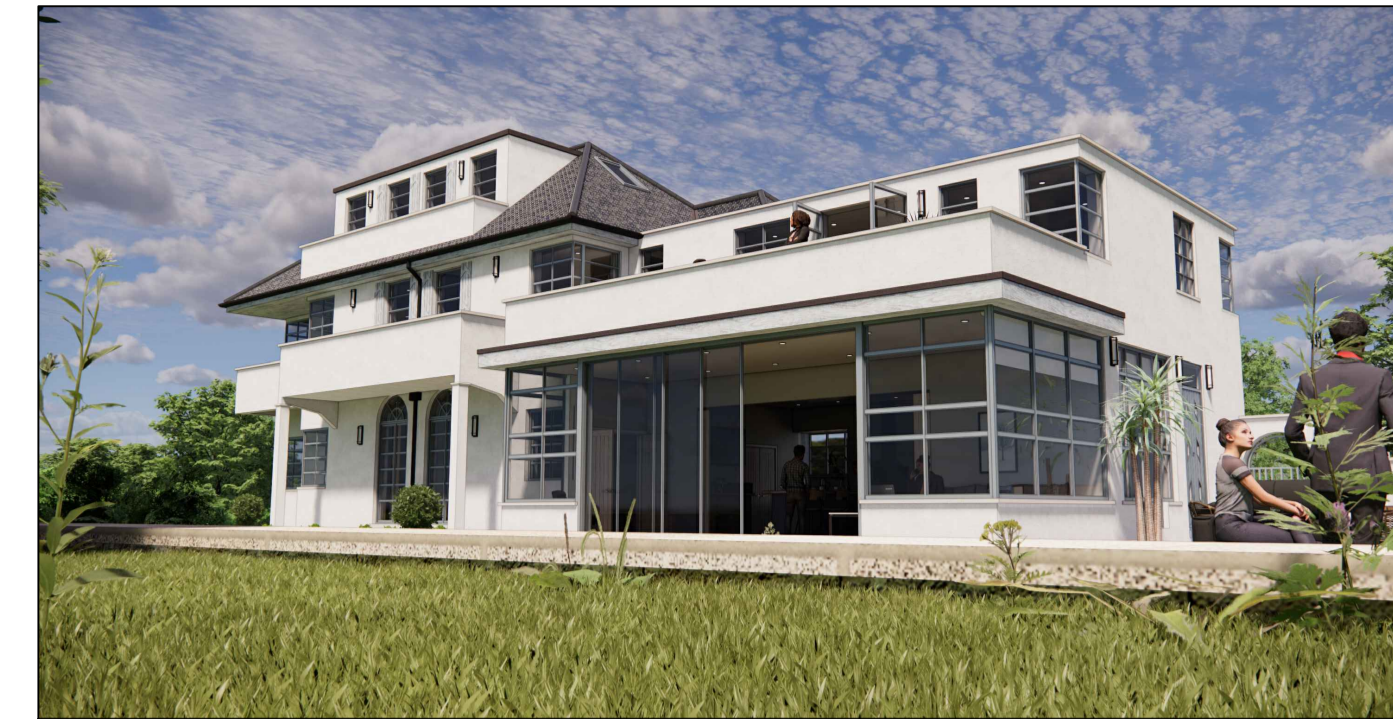
41. Batley Field Hill. Upper Batley. Batley. Kirklees. WF17 0BE