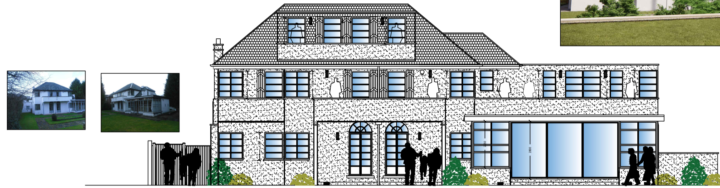
Proposed Rear Elevation ( East)