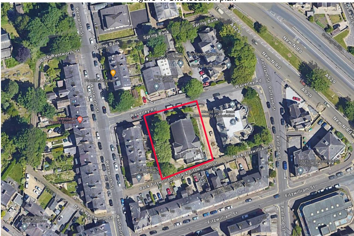
Figure 2 Aerial view of the site, surrounds and specific buildings surveyed.