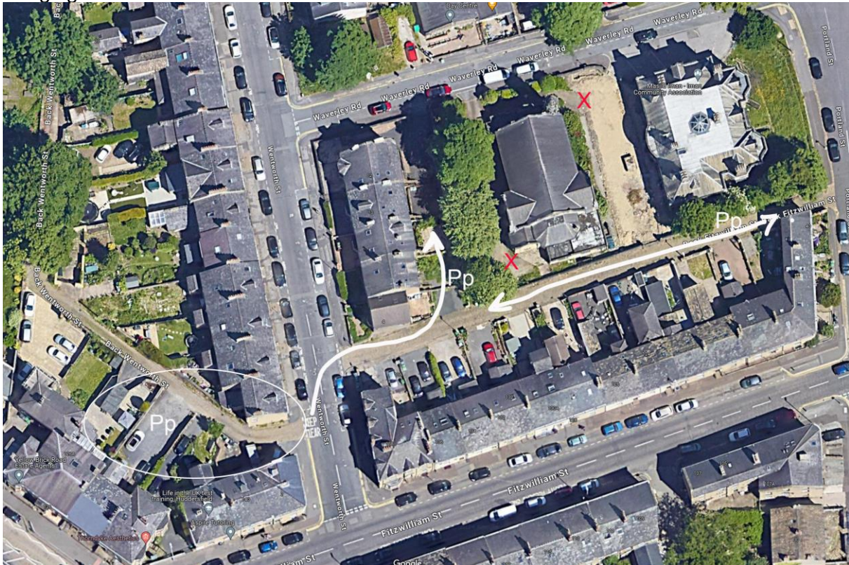
Figure 3. Flight pattern and main areas of bat activity

previously with singletons passing through the site and feeding briefly before moving on to other foraging sites.