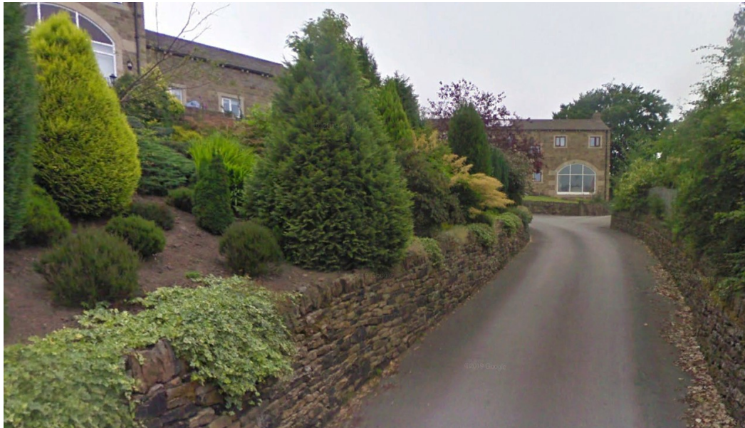
View along Stubbin Fold towards the North. Part of Number 3 is seen at the end of the road, towards the right.

The proposed front entrance porch is a modest single storey un-enclosed structure built using materials that dominate the conservation area – local sandstone and stone slates. It will be built on top of the existing stone plinth on which the property sits. It projects approximately 2.5 metres from the front face of the house and, at the ridge, will be approximately 3.0 metres high. The aim of the design is to improve the experience of the final stages of the approach to the house and entry into it, this currently being a shortfall of the original design. The impact of the proposed porch on the Conservation Area and surrounding properties will be negligible given its size, appearance and location.