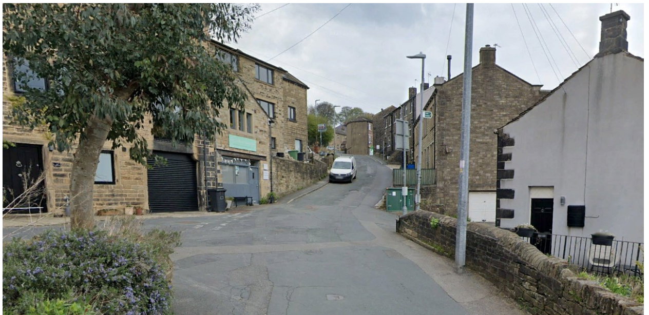
View along Ford Gate towards the North-East