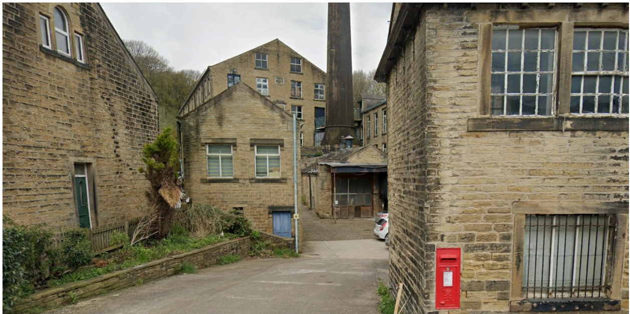
View of Yew Tree Mill from Woodhead Road