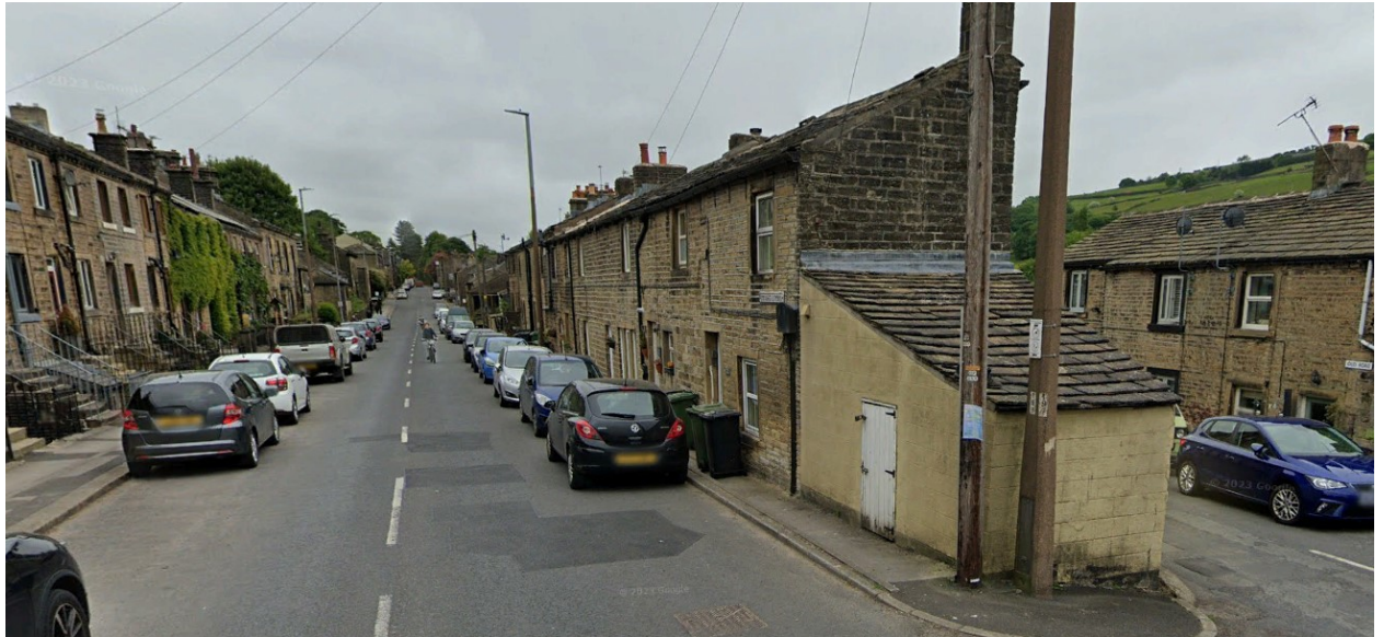
View along Woodhead Road towards the East

Stubbin fold is an unadopted road that connects with Woodhead Road to the south. There is no written appraisal for the Hinchcliffe Mill Conservation Area, but it is predominantly characterized by strings of irregularly sized and shaped stone built houses set along the south facing slope of the Holme valley, either side of Woodhead Road. The houses would have originally been for workers at Yew Tree Mill that is set in a small, steep sided tributary valley or Hinchcliffe Mill set in the main valley bottom. Towards the edges of the conservation area there is a mixture of older houses set in tight groups or 'folds' and a number of more dispersed buildings, including a chapel.