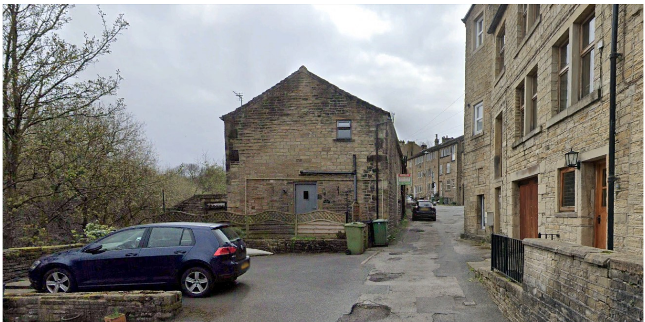
View along Water Street towards the West.