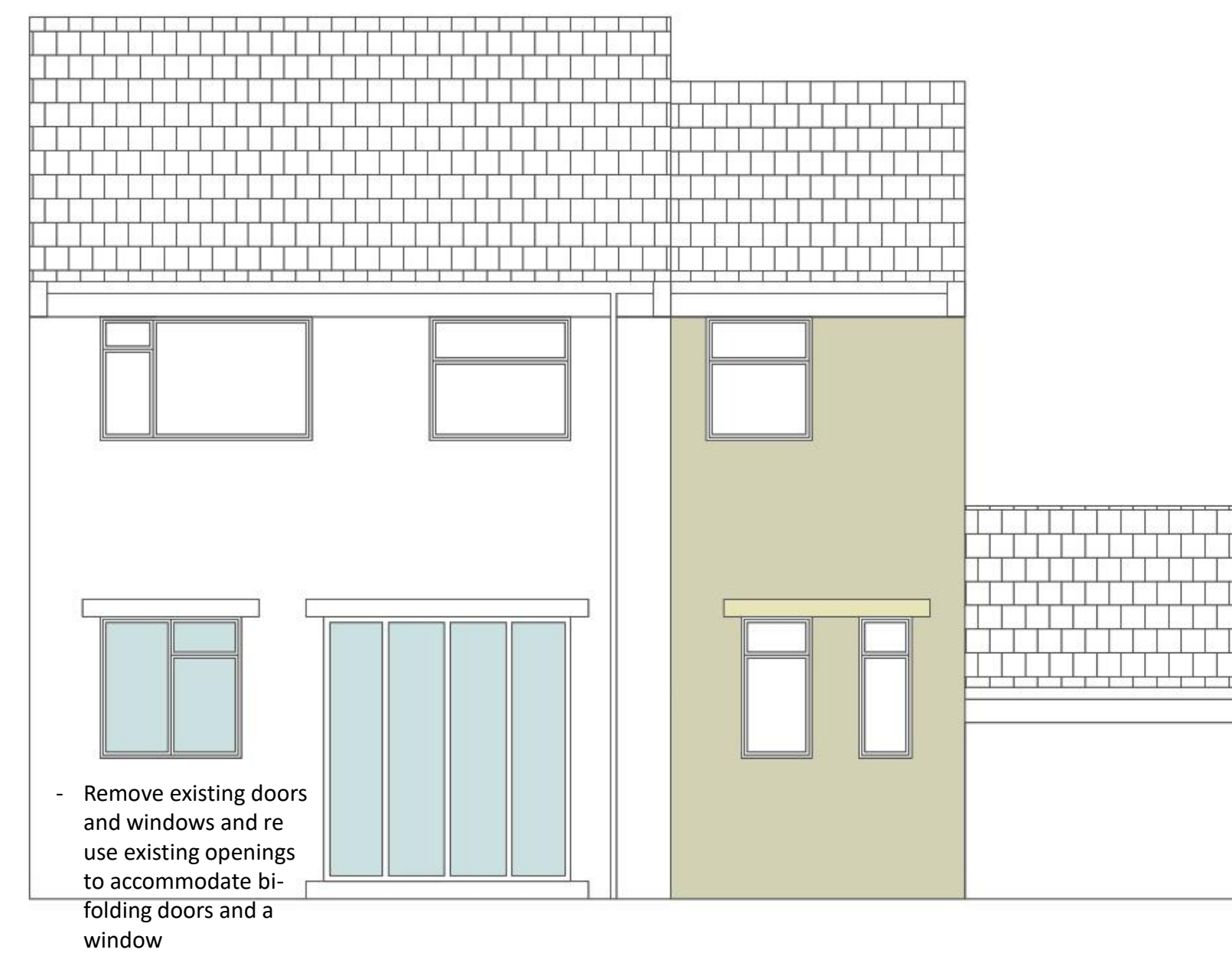
Proposed Rear Elevation 1:50@A1

- Extension will be built using matching materials to existing property.