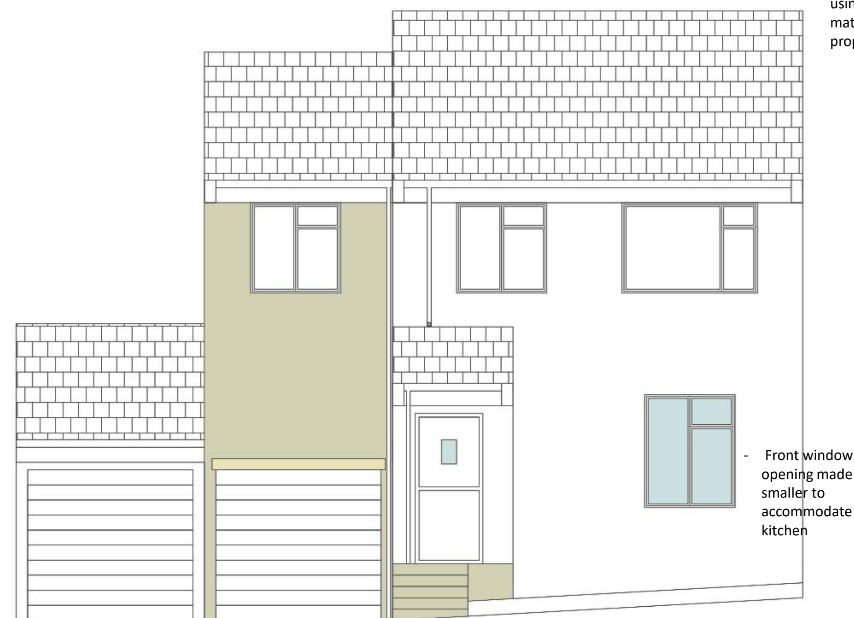
Proposed Front Elevation 1:50@A1