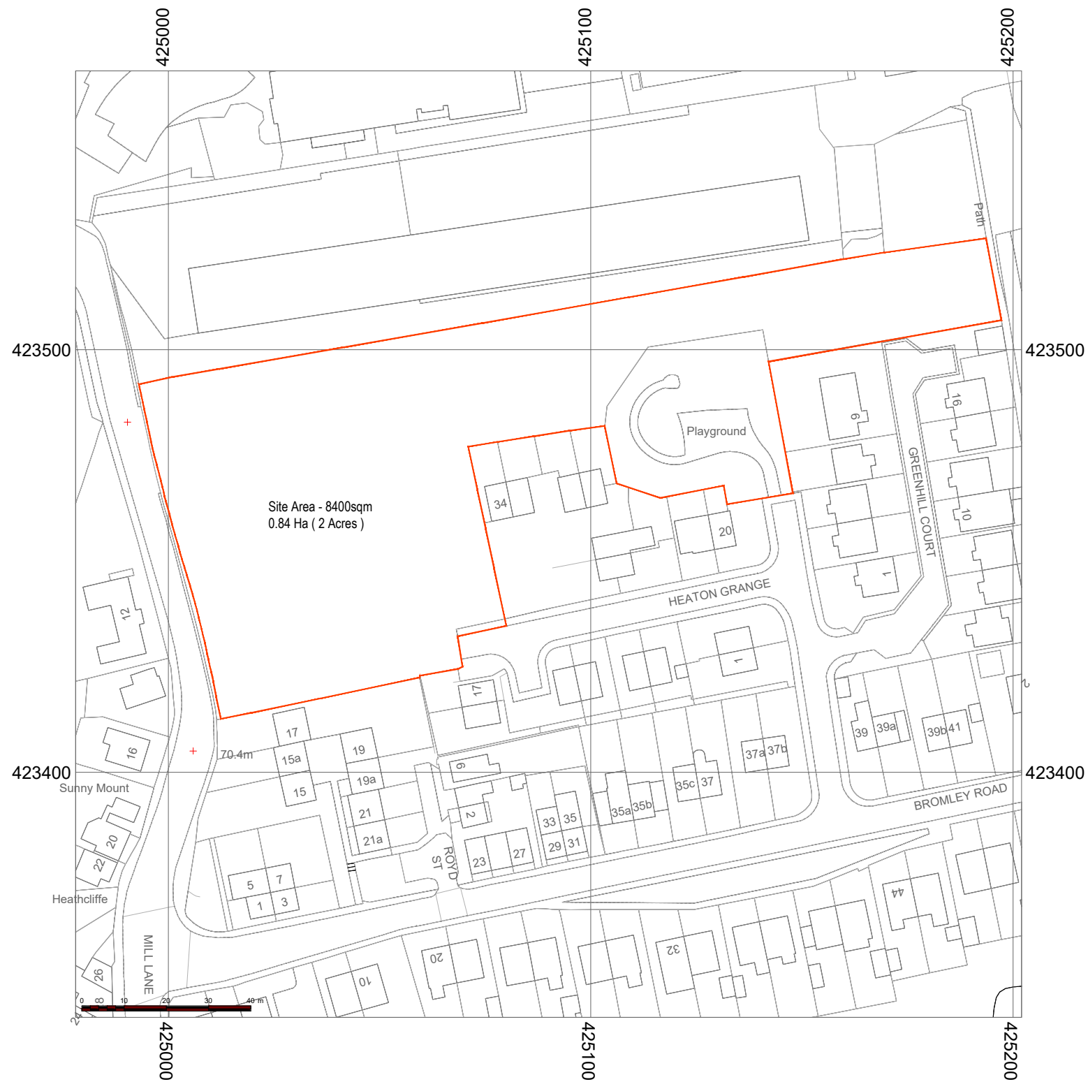
Location Plan 1:1250 at A3