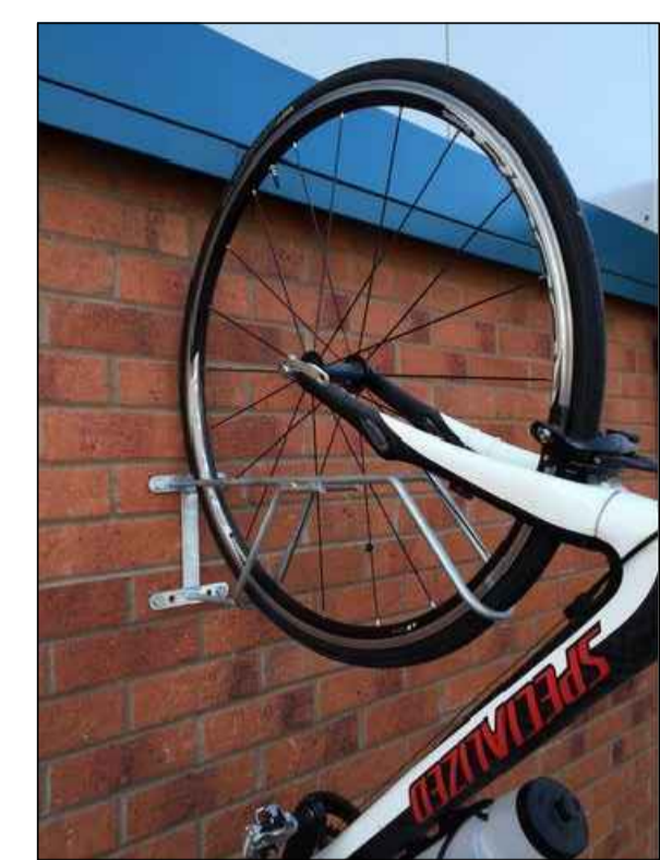
② Denotes internally mounted wall vertical cycle hook