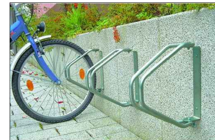
① Denotes externally mounted wall cycle hook