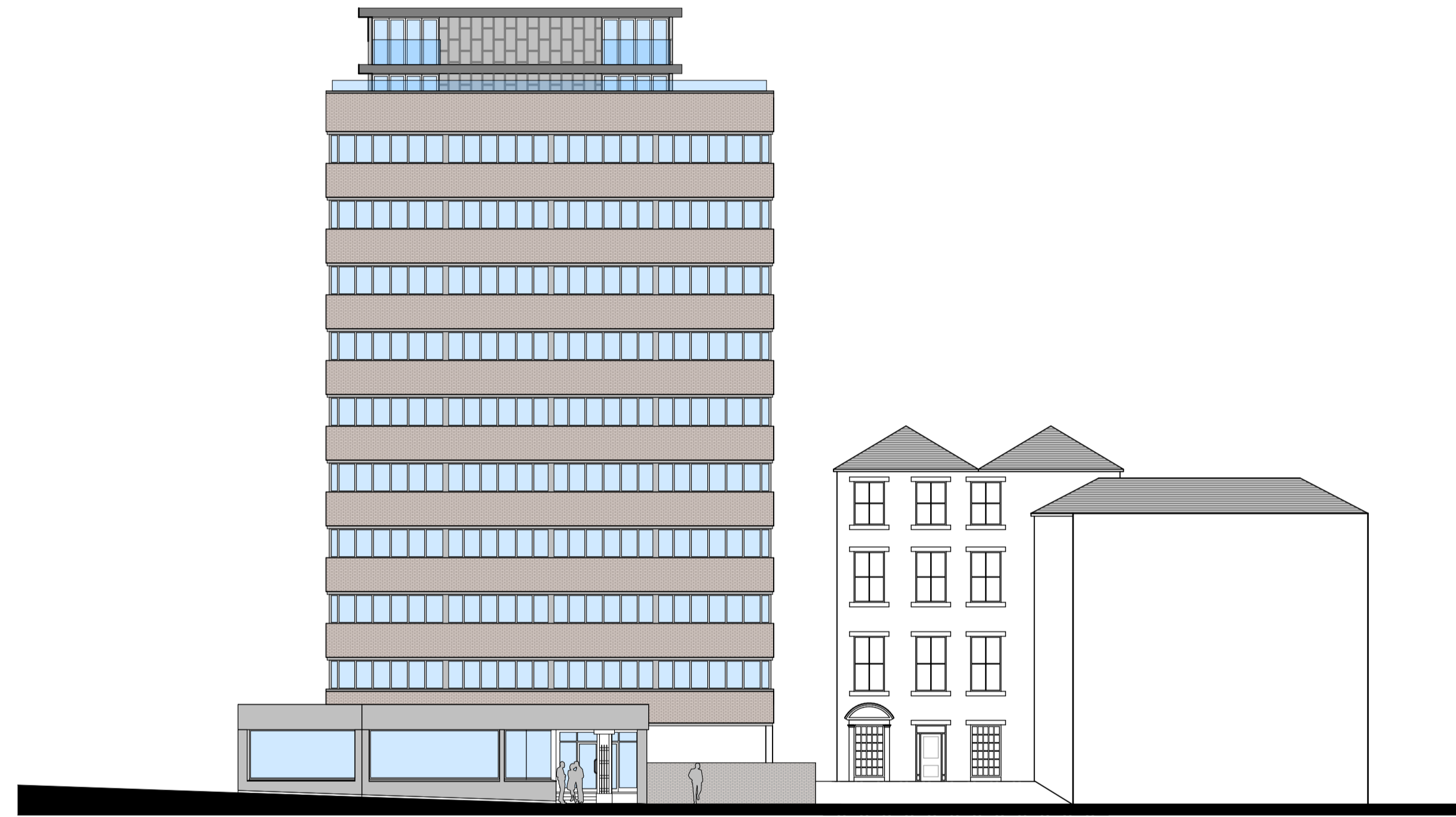
MARKET STREET ELEVATION (MACAULEY STREET SQUARE ELEVATION)

NOTE: EXISTING OVERALL HEIGHT TO REMAIN AS EXISTING