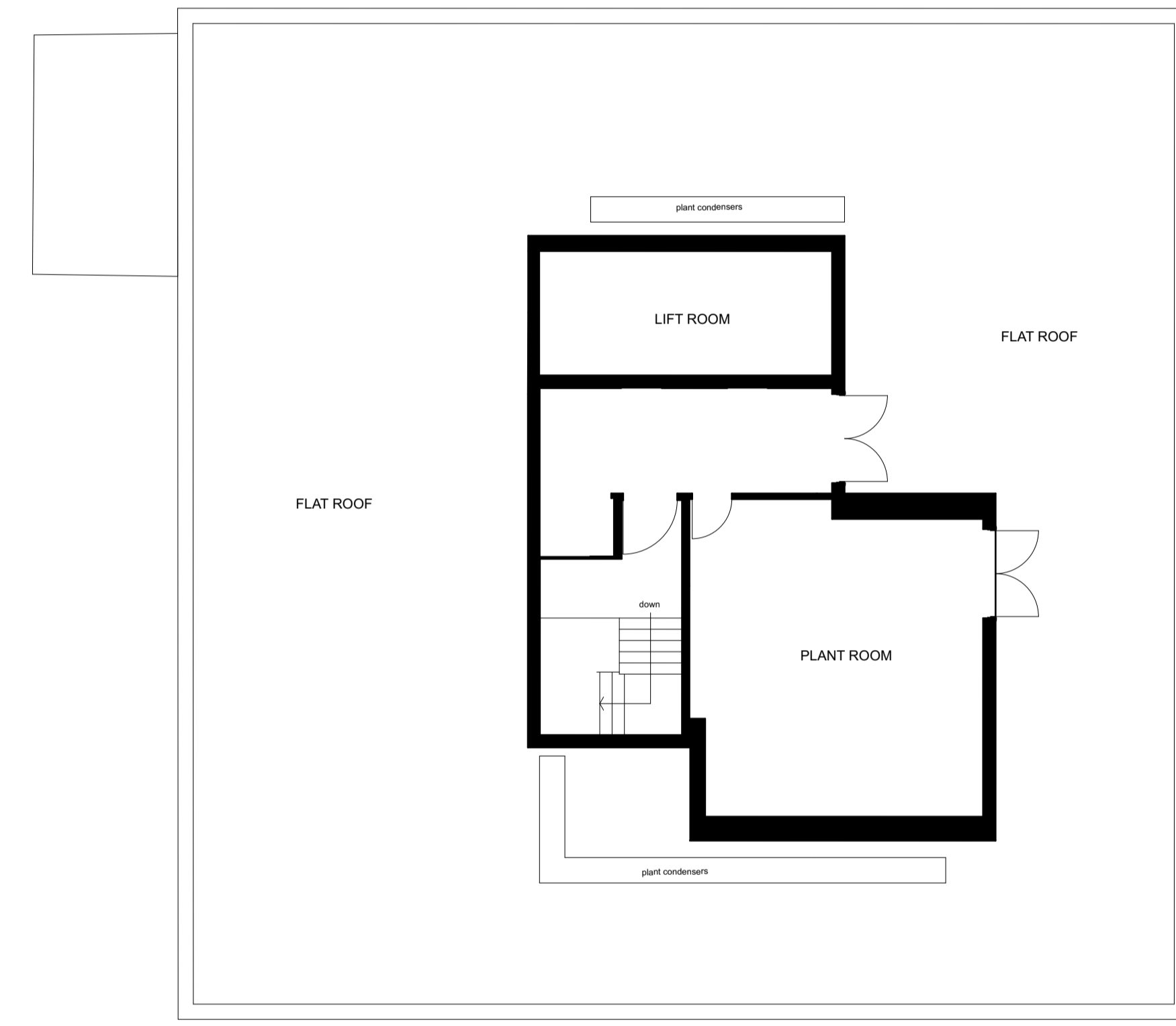
EXISTING ROOF PLAN