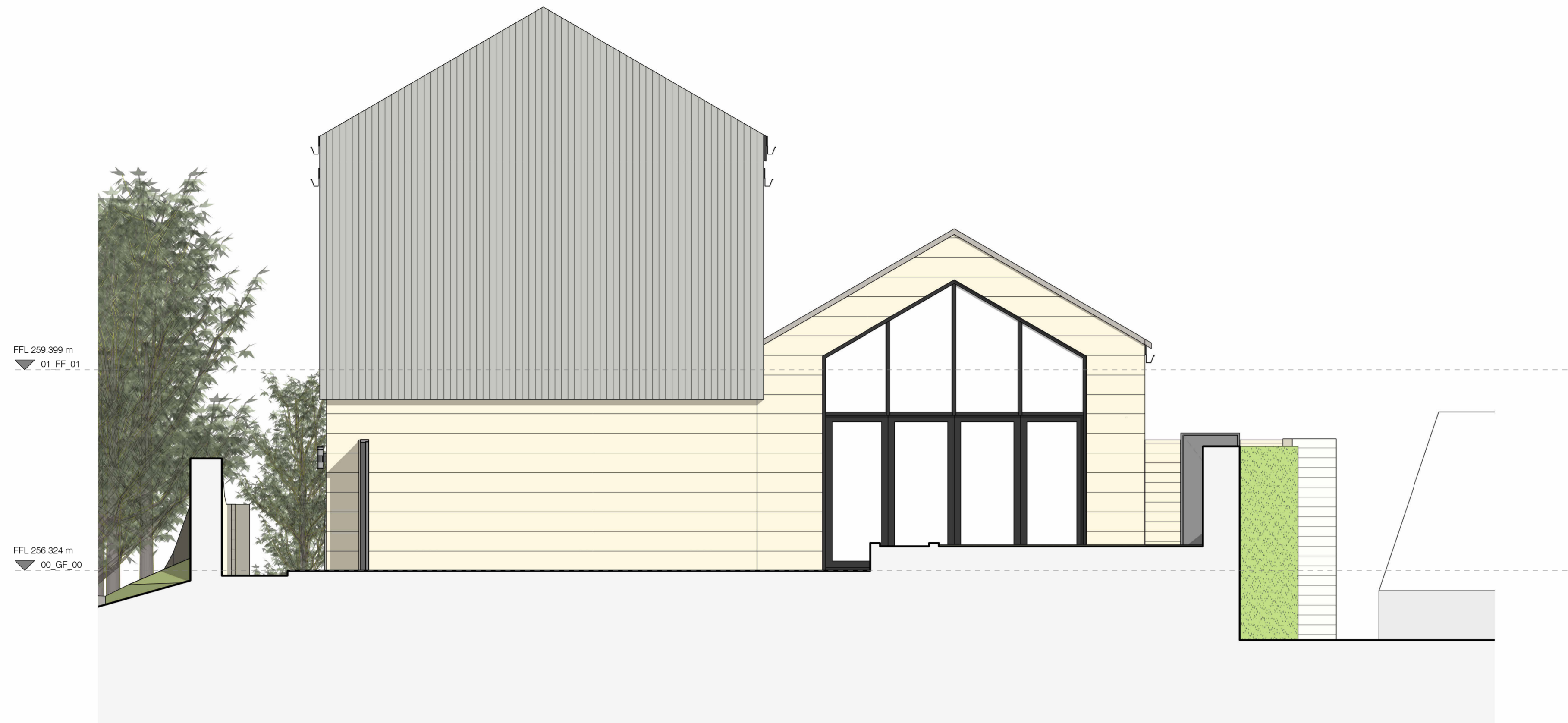
C - PROPOSED REAR ELEVATION 1 : 50