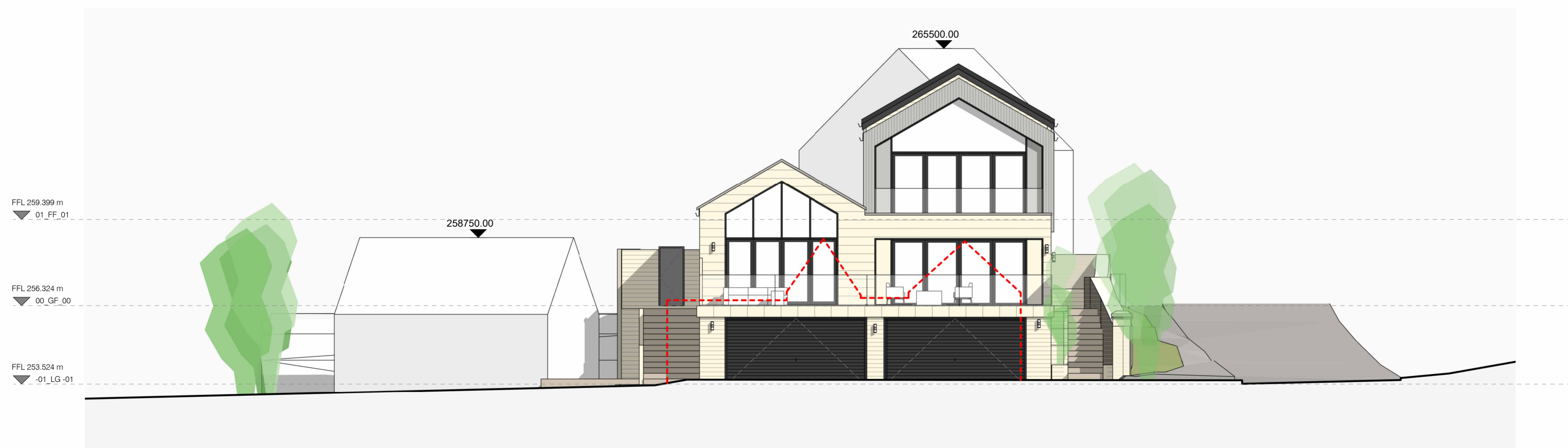
B - PROPOSED LANE FRONT STREET ELEVATION 1 : 100