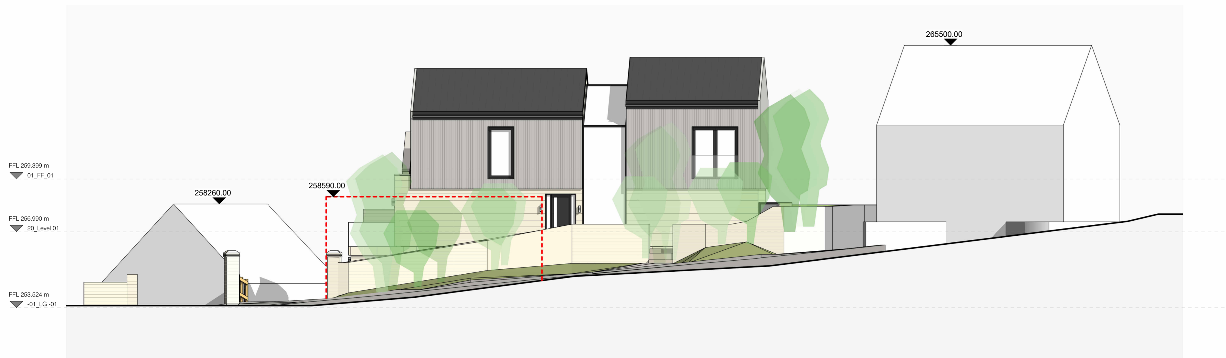
A - PROPOSED ROWGATE STREET ELEVATION 1 : 100