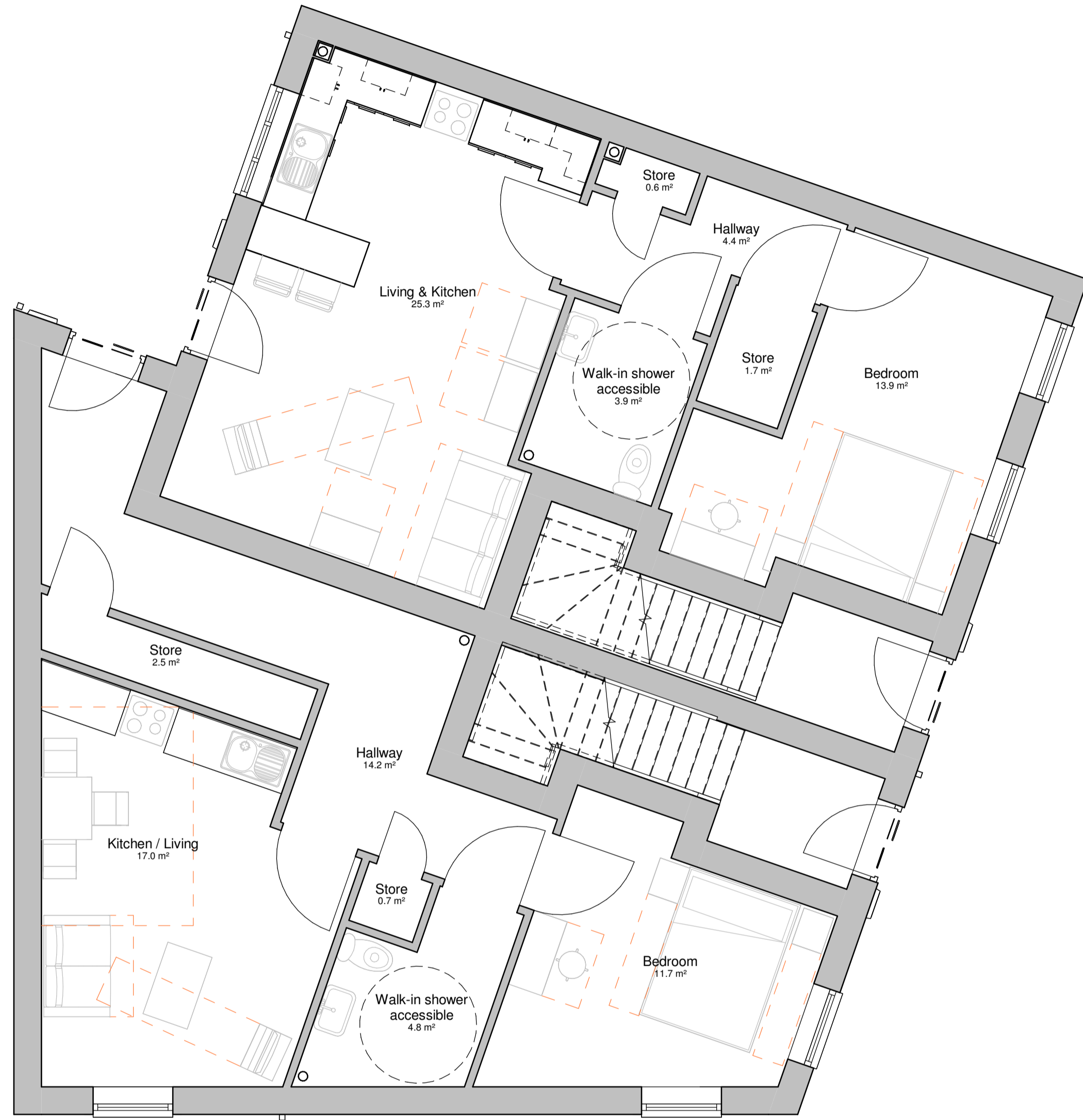
00 1BF 50m 2 Ground Floor Plan 1 : 50