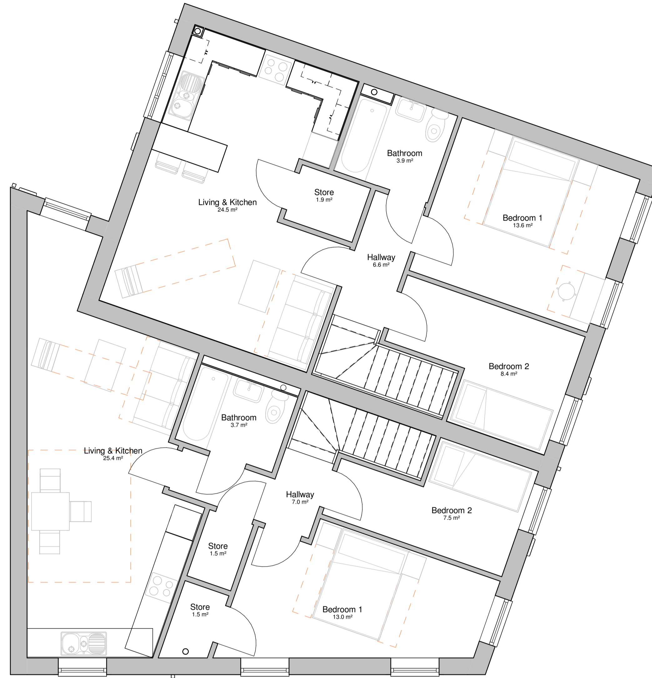
01 2BF 61m 2 First Floor Plan 1 : 50