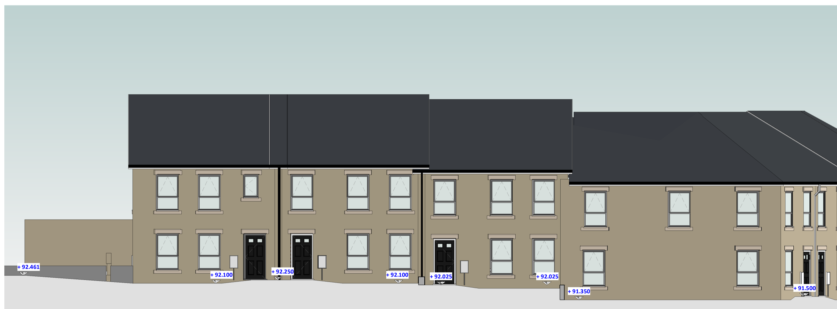
Street Elevation - George Street 1 : 100