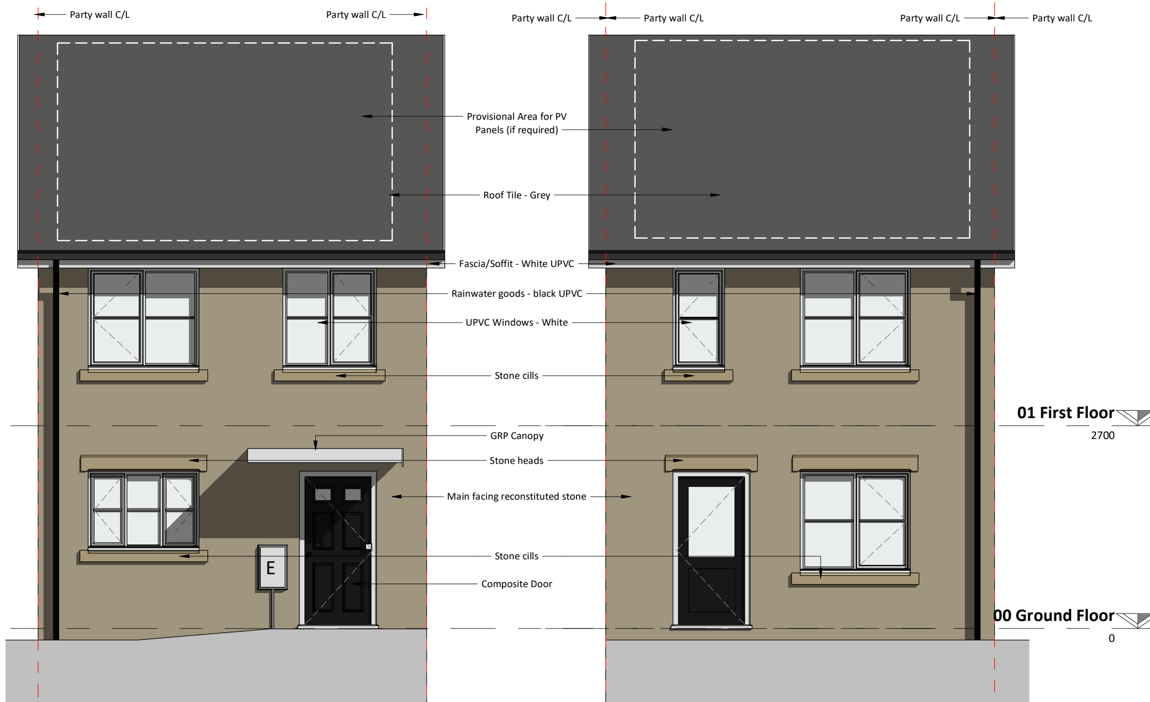
Front Elevation 1 : 50

All materials and workmanship to be in accordance with the current British Standards and codes of practice.