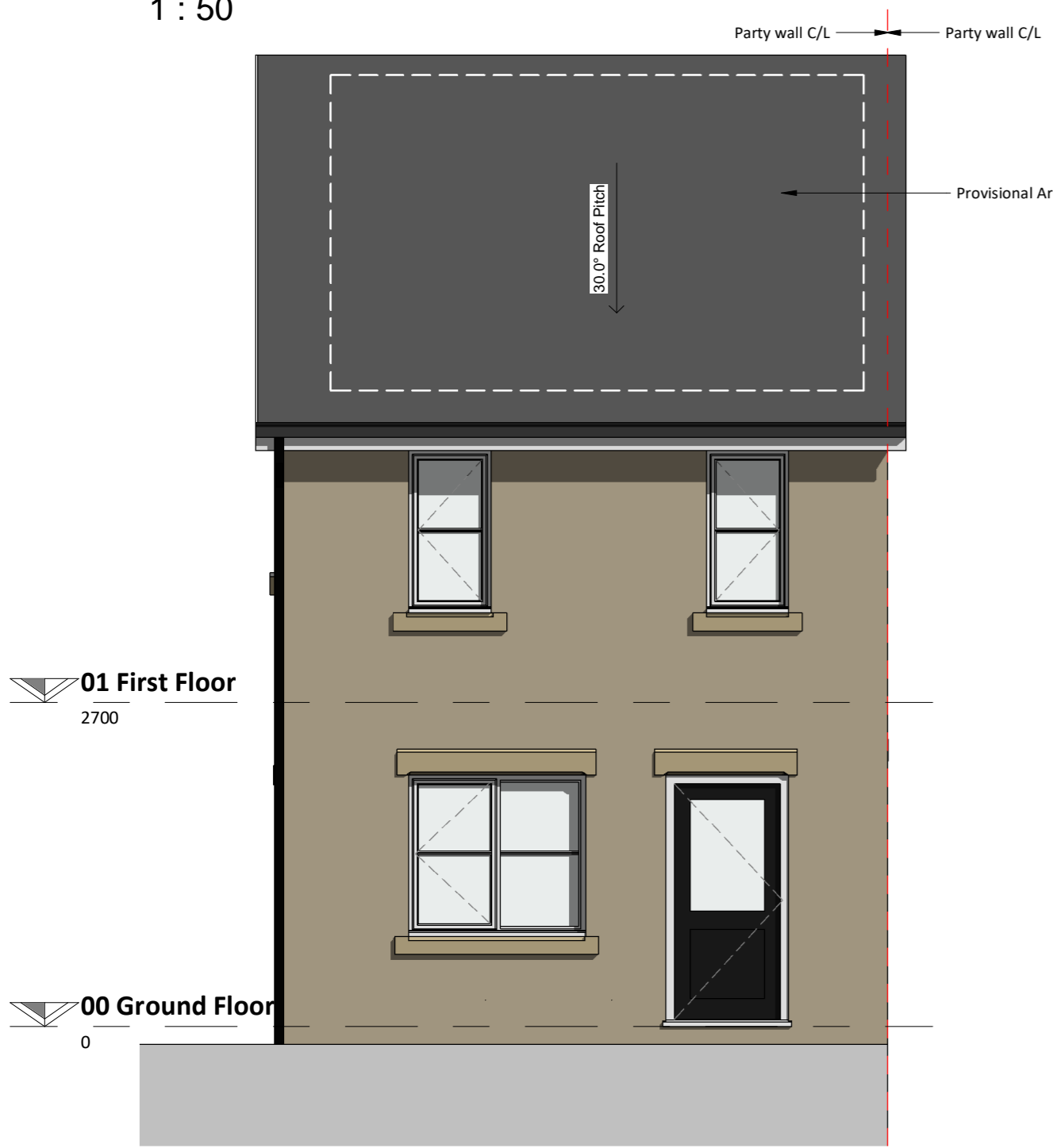
Rear Elevation 1 : 50