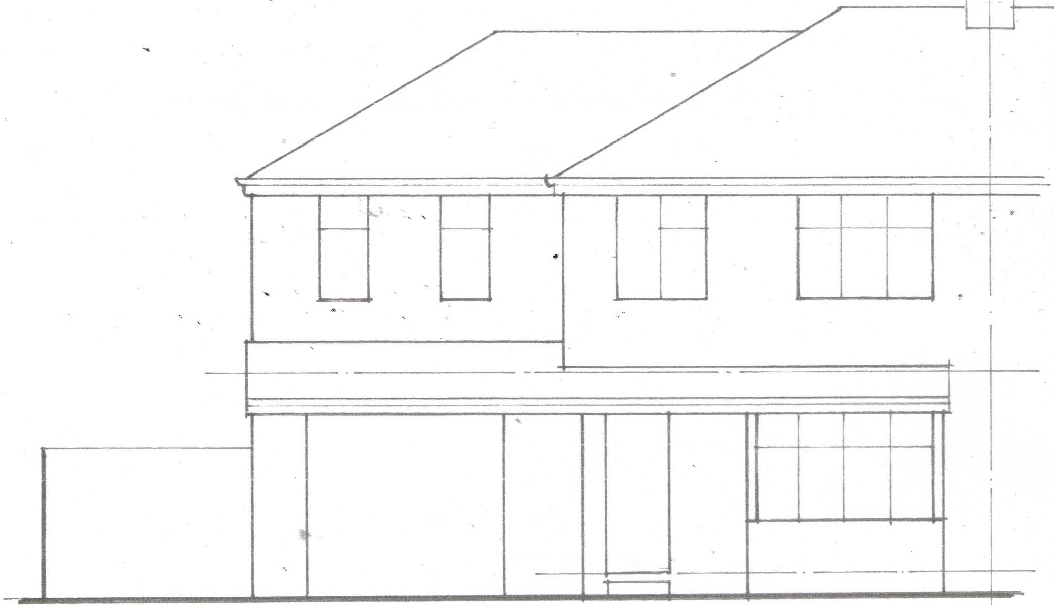
EXISTING FRONT ELEVATION SCALE 1:50 @ A-B.