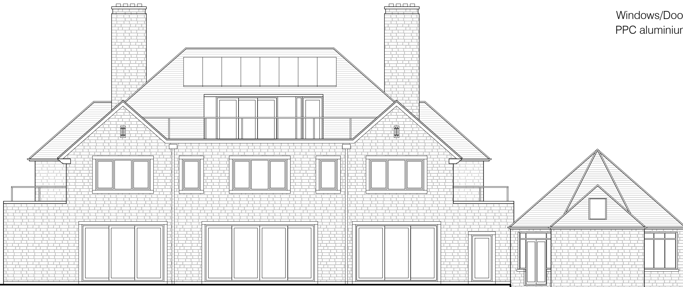
Proposed South Elevation - 1:100