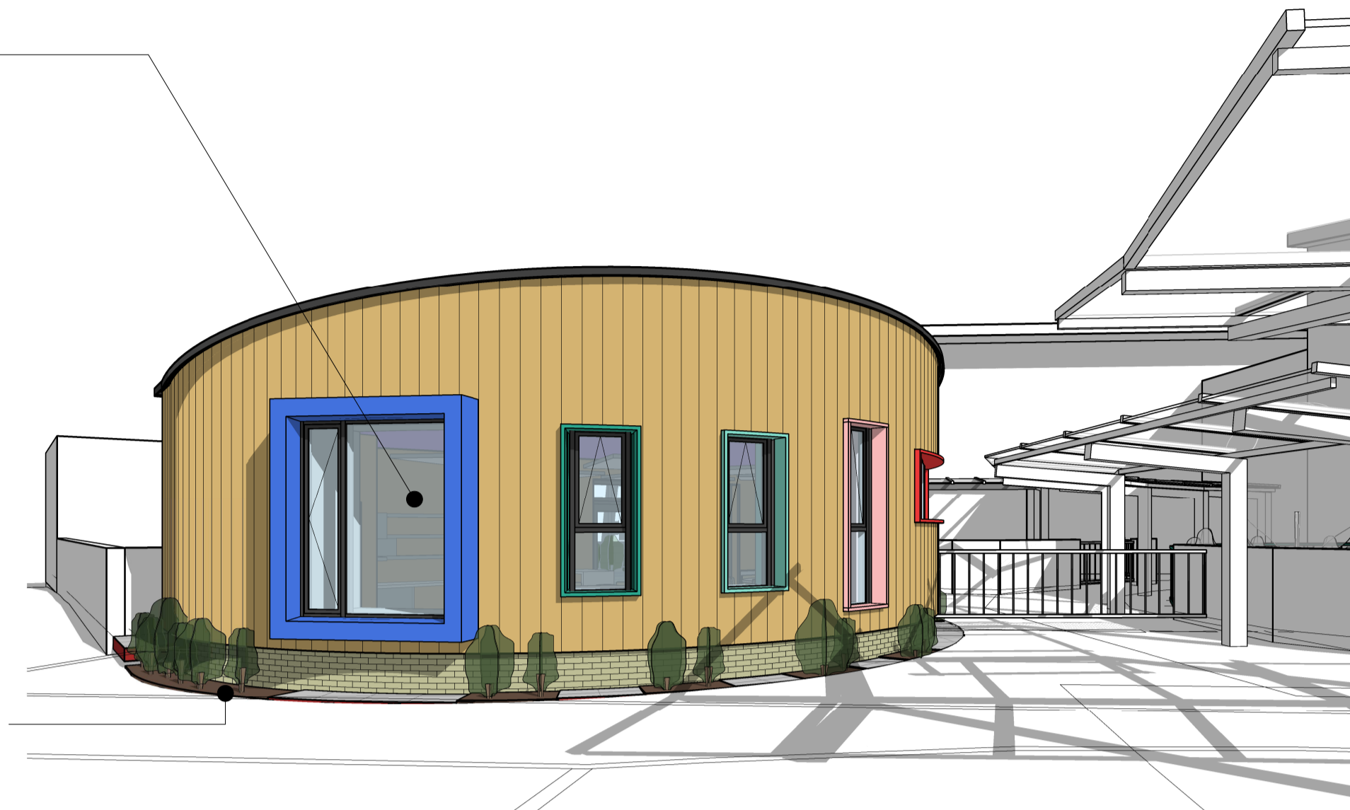
1. VIEW FROM CAR PARK ENTRANCE FROM THE EAST

SOLAR PANELS FACING SOUTH TO CAPTURE SUN PATH.