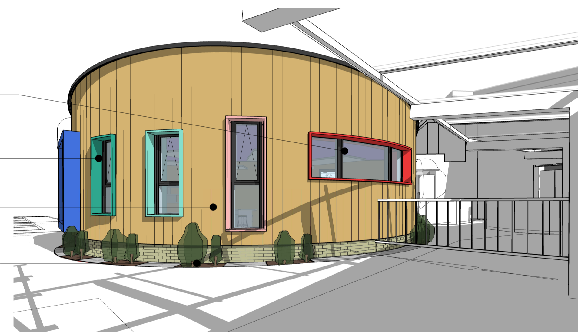
2. VIEW FROM THE NORTH EAST