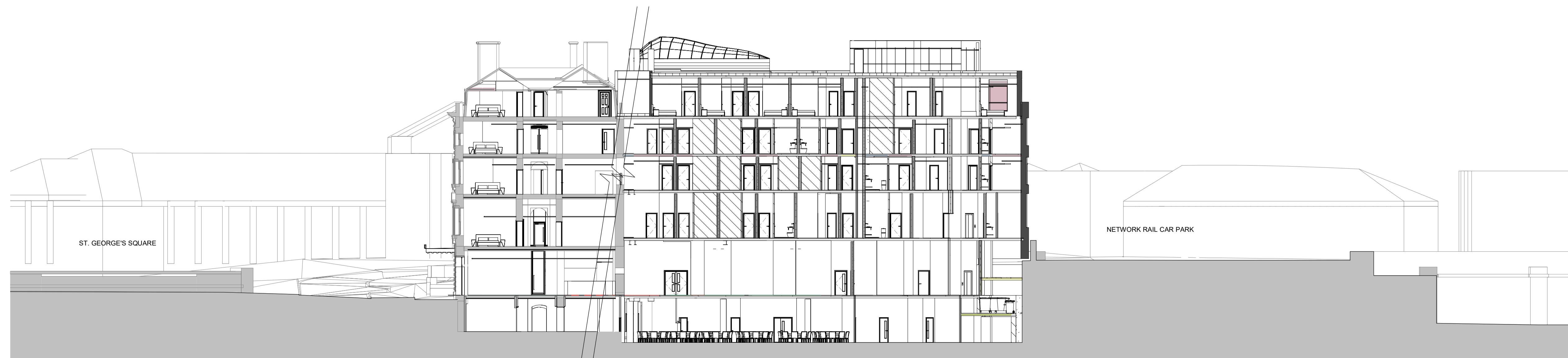
Proposed Site Section EE-1 1 : 200