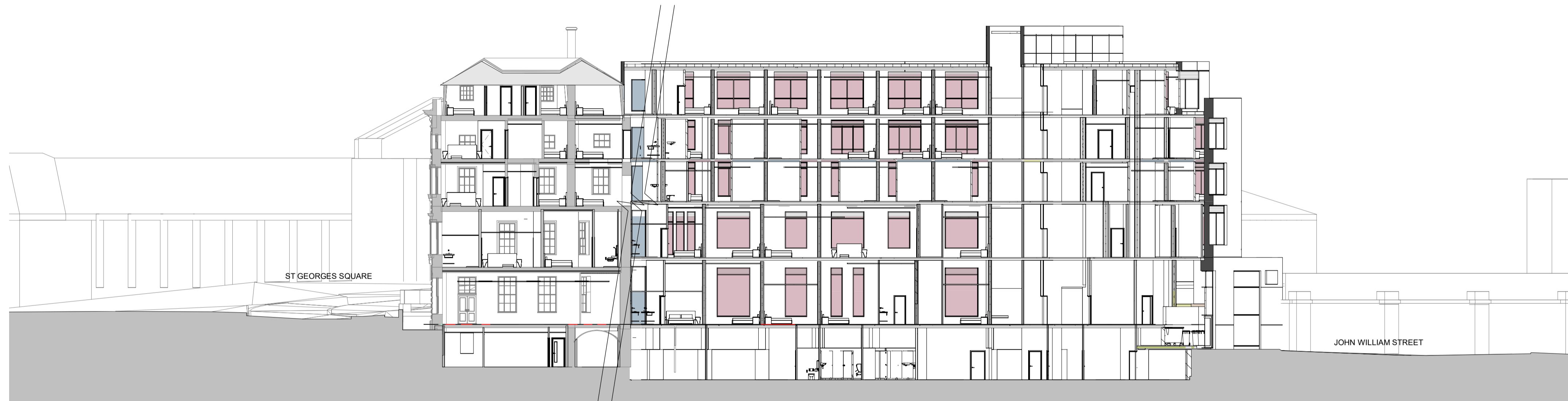
Proposed Site Section CC-1 1 : 200