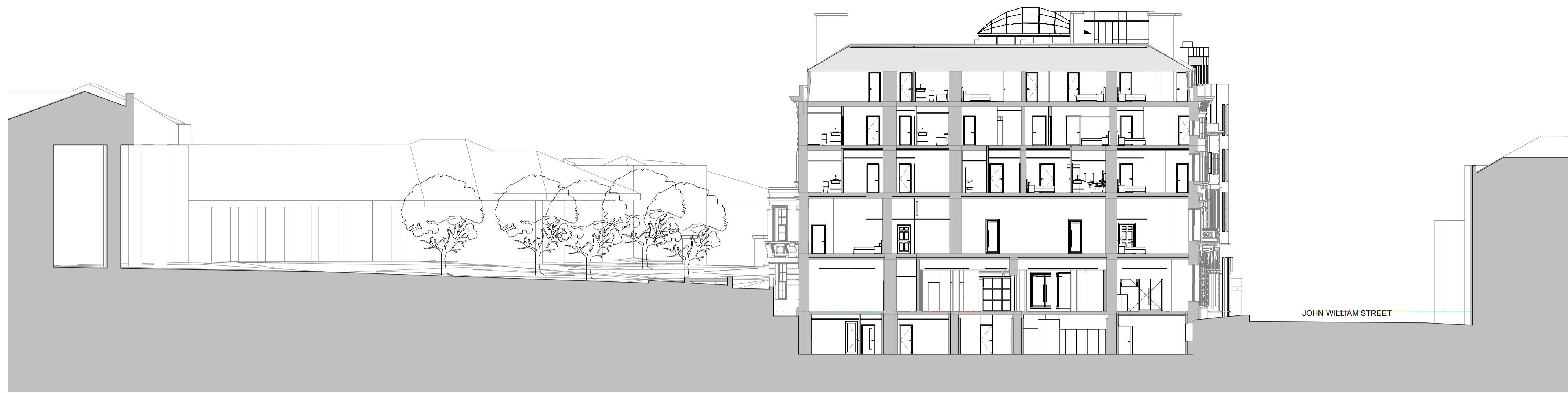
Proposed Site Section BB-1 Block A 1 : 200