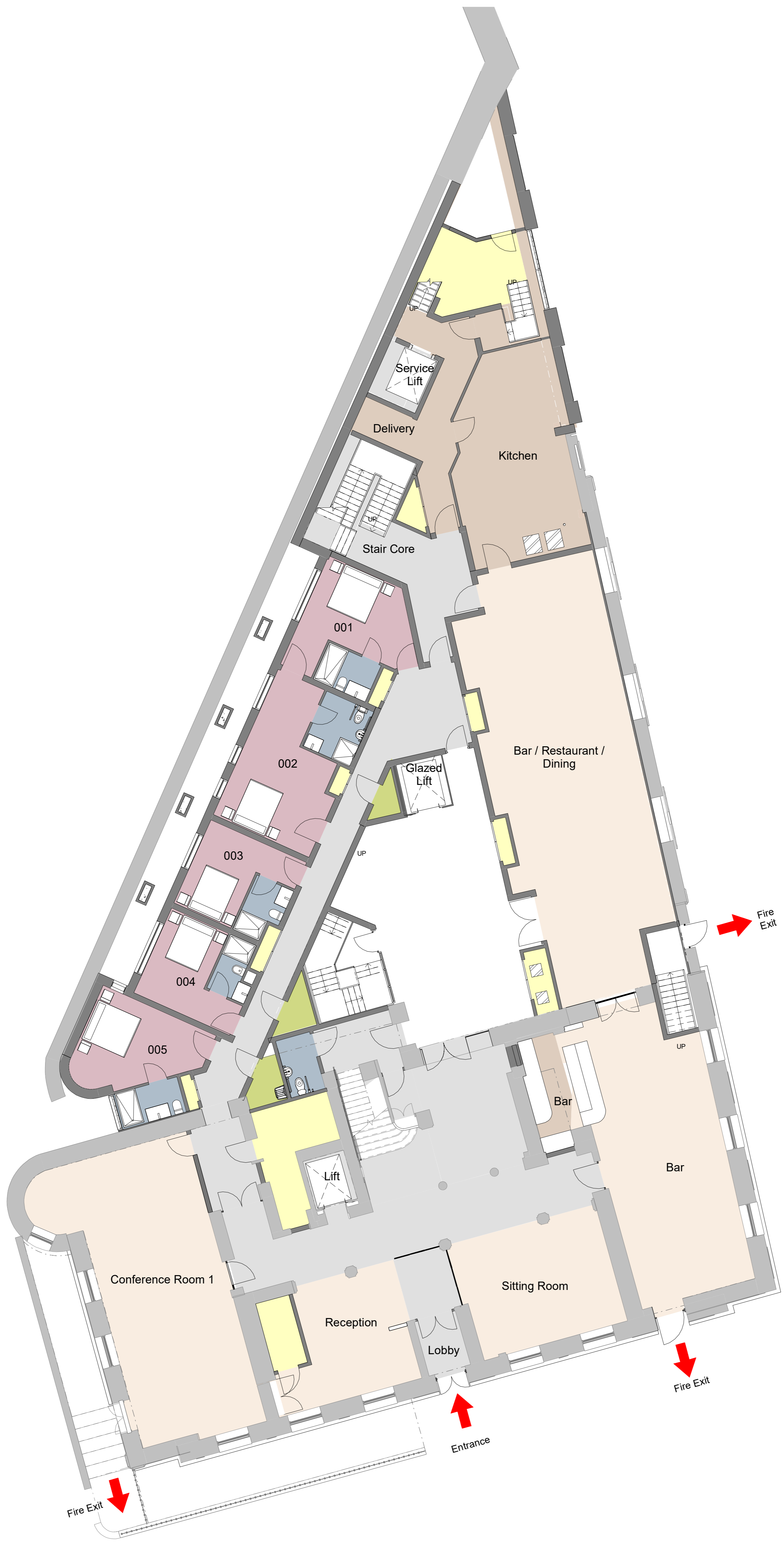
Level 00 Layout Proposed 1 : 100

— Denotes Existing Wall — Denotes Proposed Wall