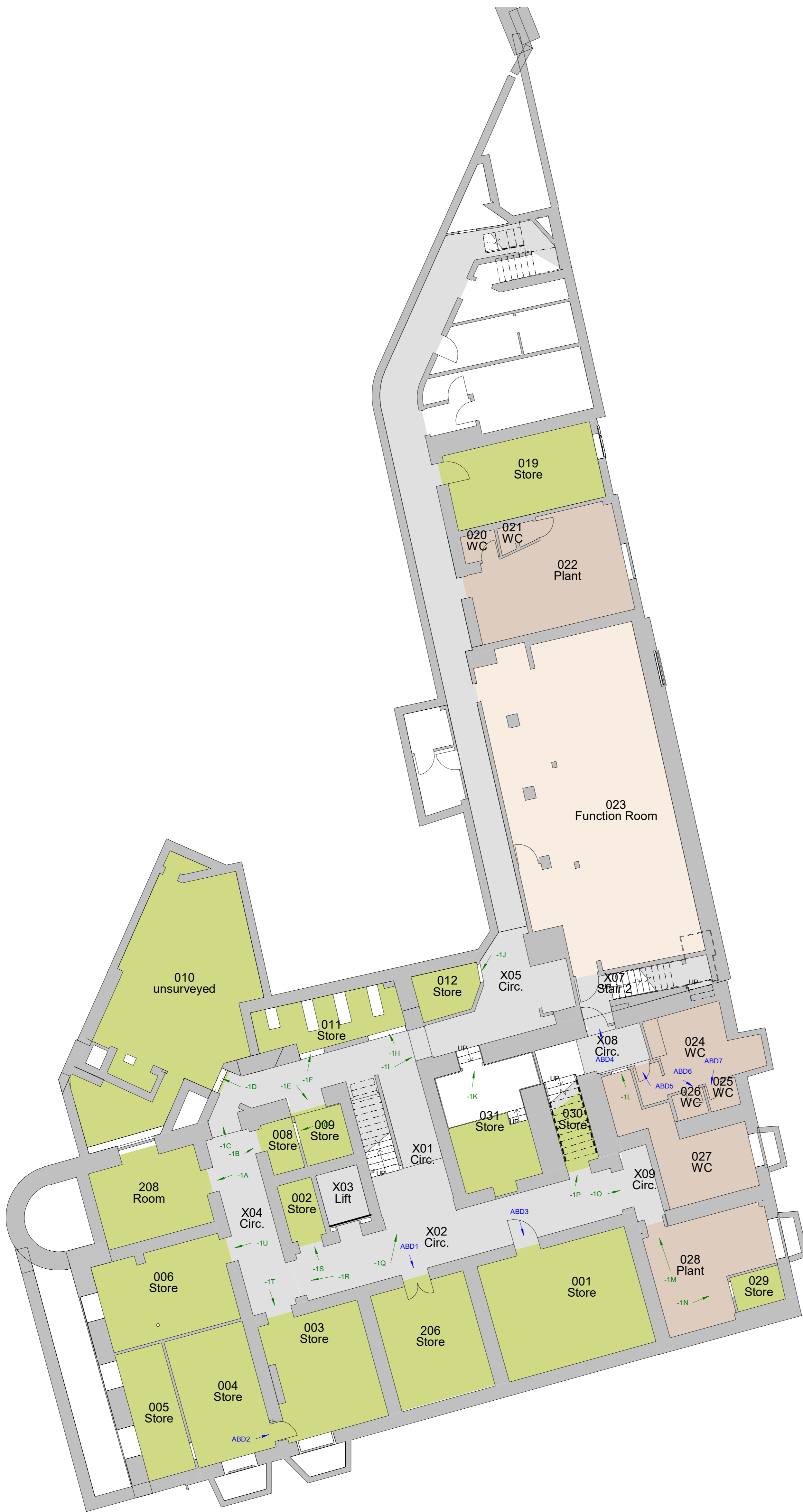
Existing Level -01 Plan 1 : 100

Refer to drawing P155 LBC Detail Doors Demo for further information.