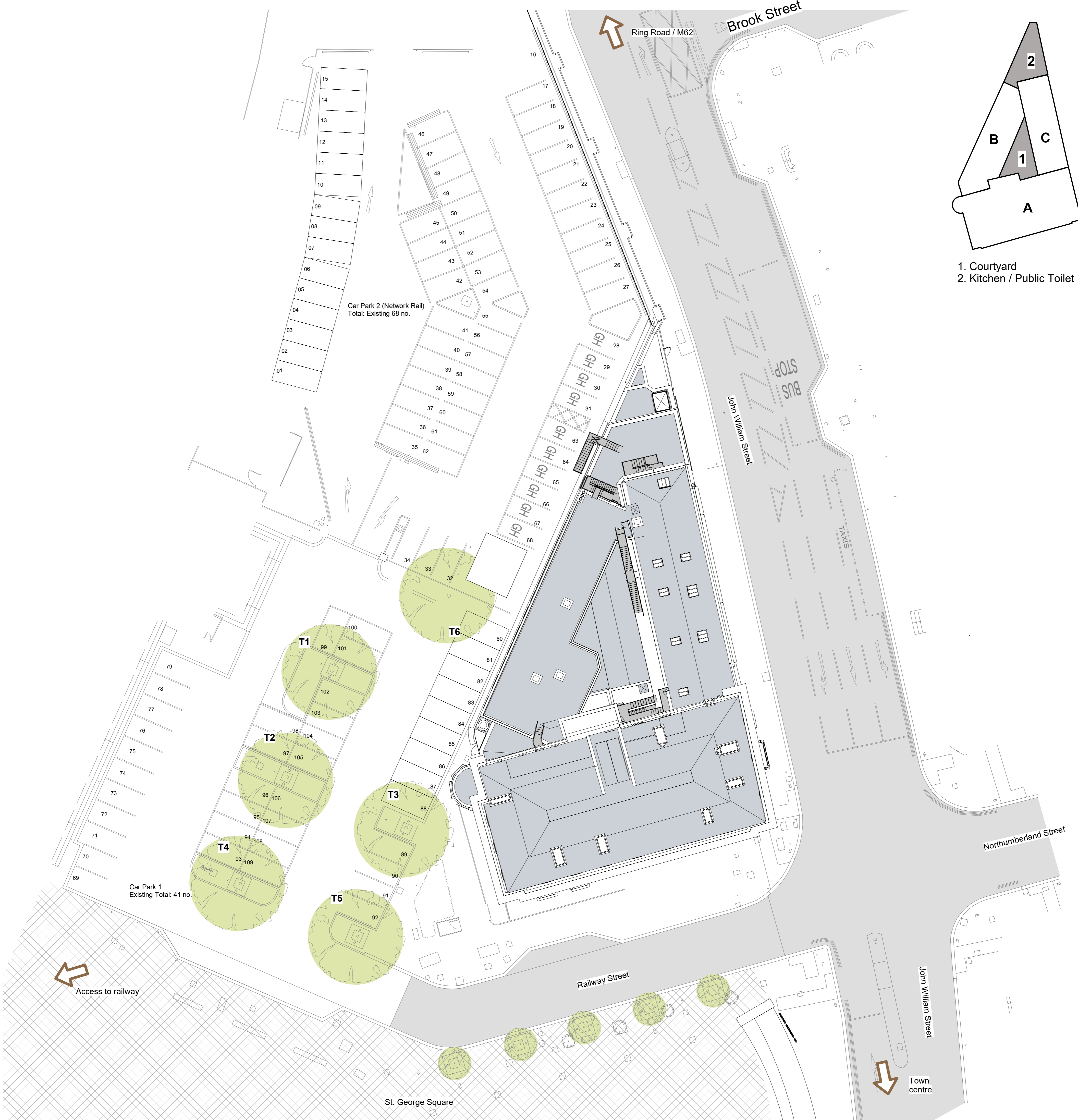
Site Layout Existing 1 : 200

Note: Information based on a third party information provided by Mobile CAD surveying solutions hence Bowman Riley cannot accept any responsibility for the information provided. The architect shall be informed about any inaccuracies as soon as possible. Red line boundary indicative.