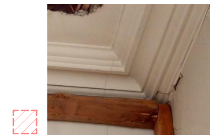
Level 2 Type B