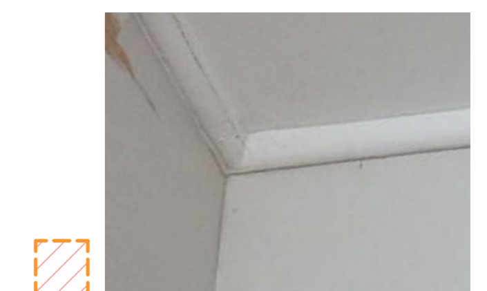
Level 3 Type A

No historic cornice extant - further investigation required