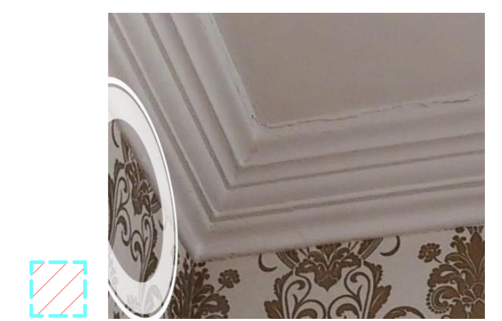
Level 2 Type C