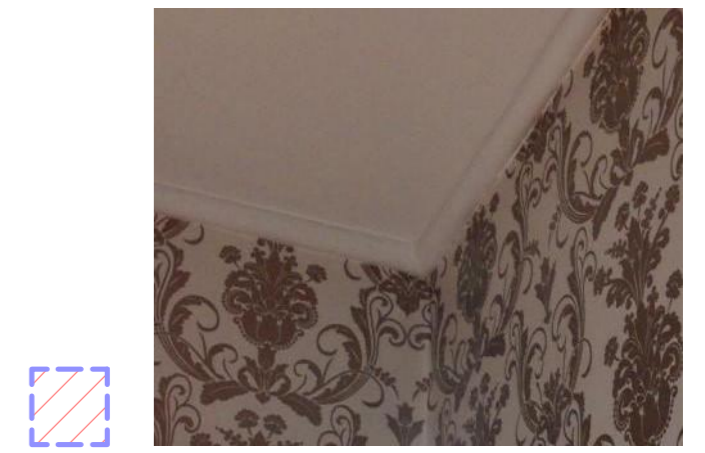
Level 2 Type A