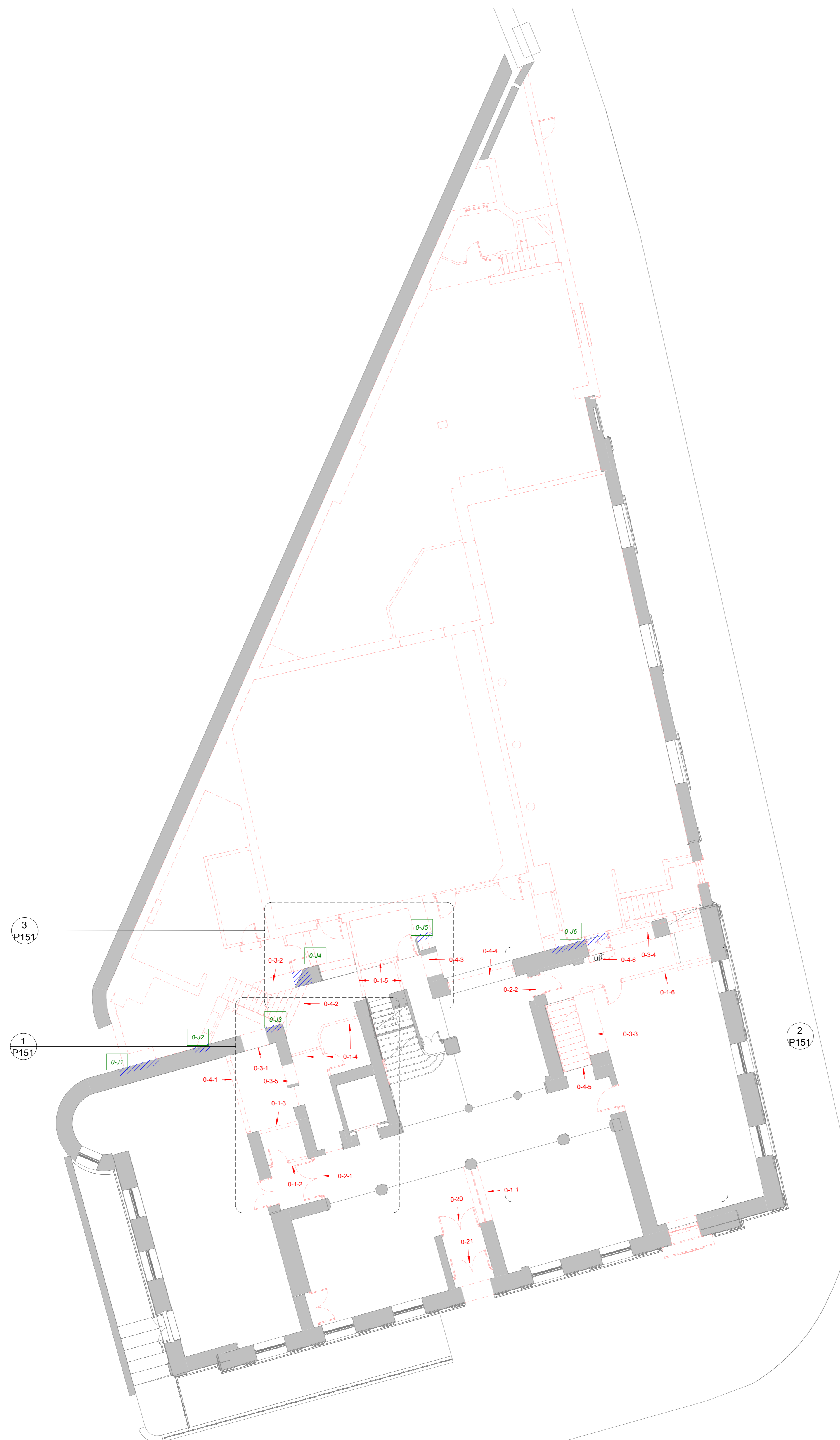
Block A Level 00 Layout Demolition 1 : 100