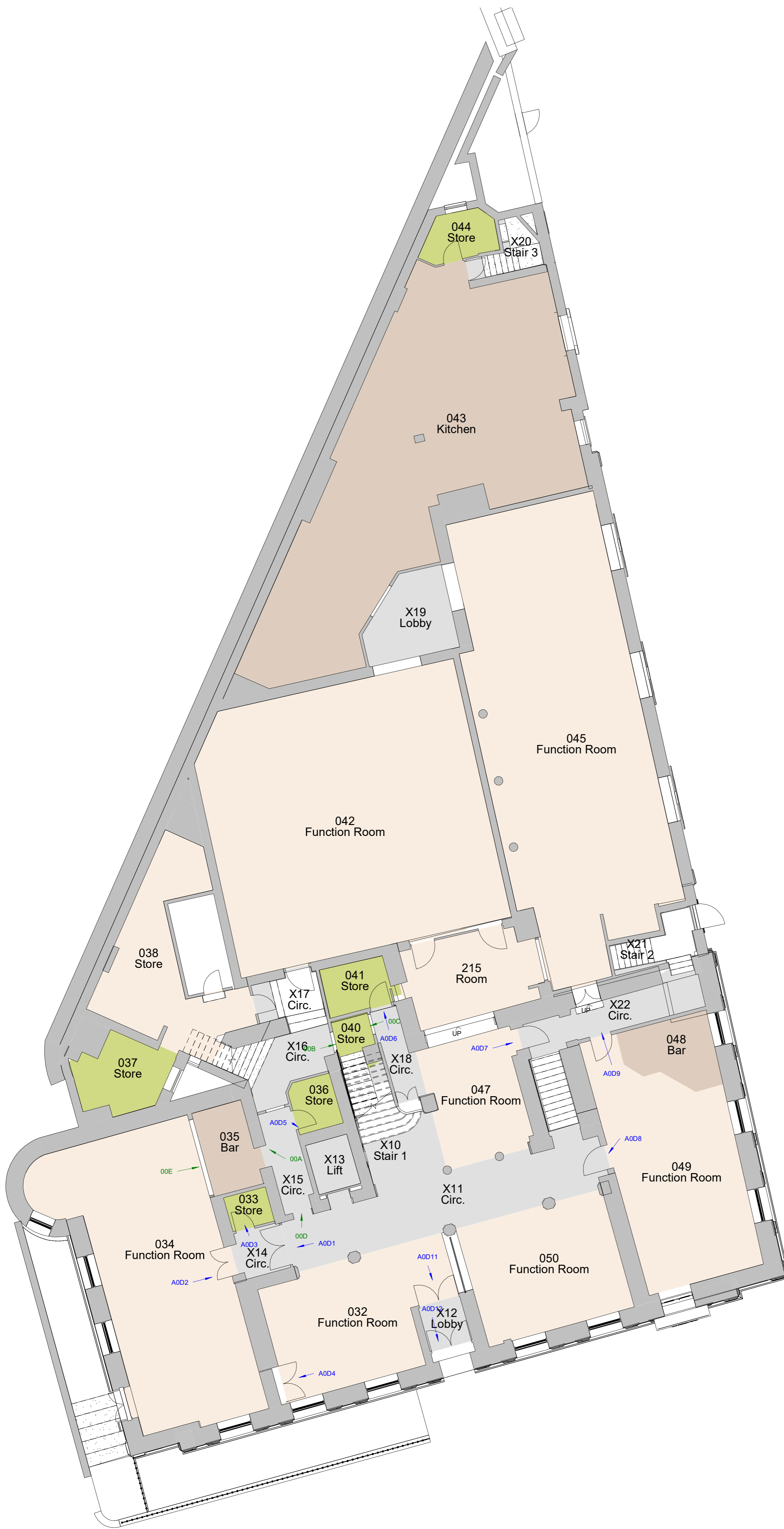
Existing Level 00 Plan 1 : 100

Photo ident: Existing Doors → Photo ident: Existing Openings → Refer to drawing P155 LBC Detail Doors Demo for further information.