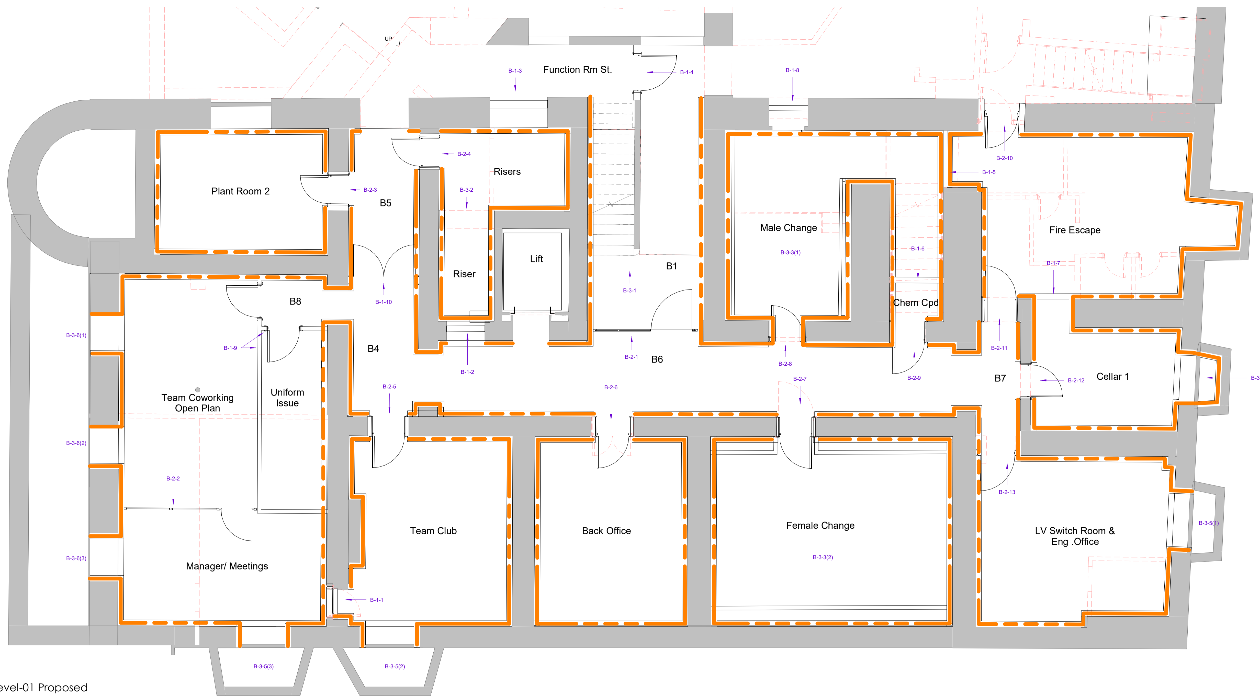
LBC Level-01 Proposed 1 : 50