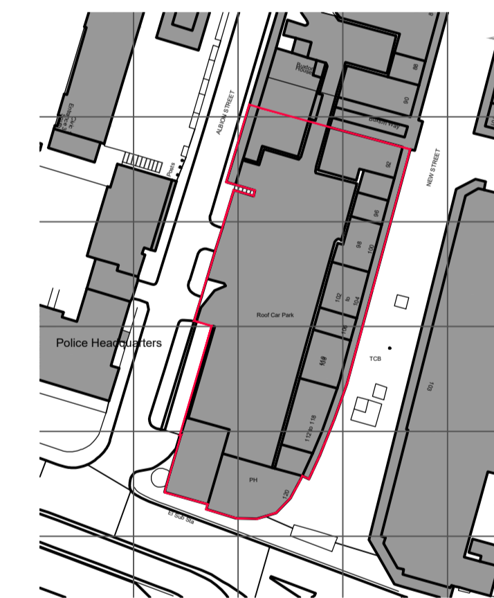
Proposed Site Location Plan 1:1250