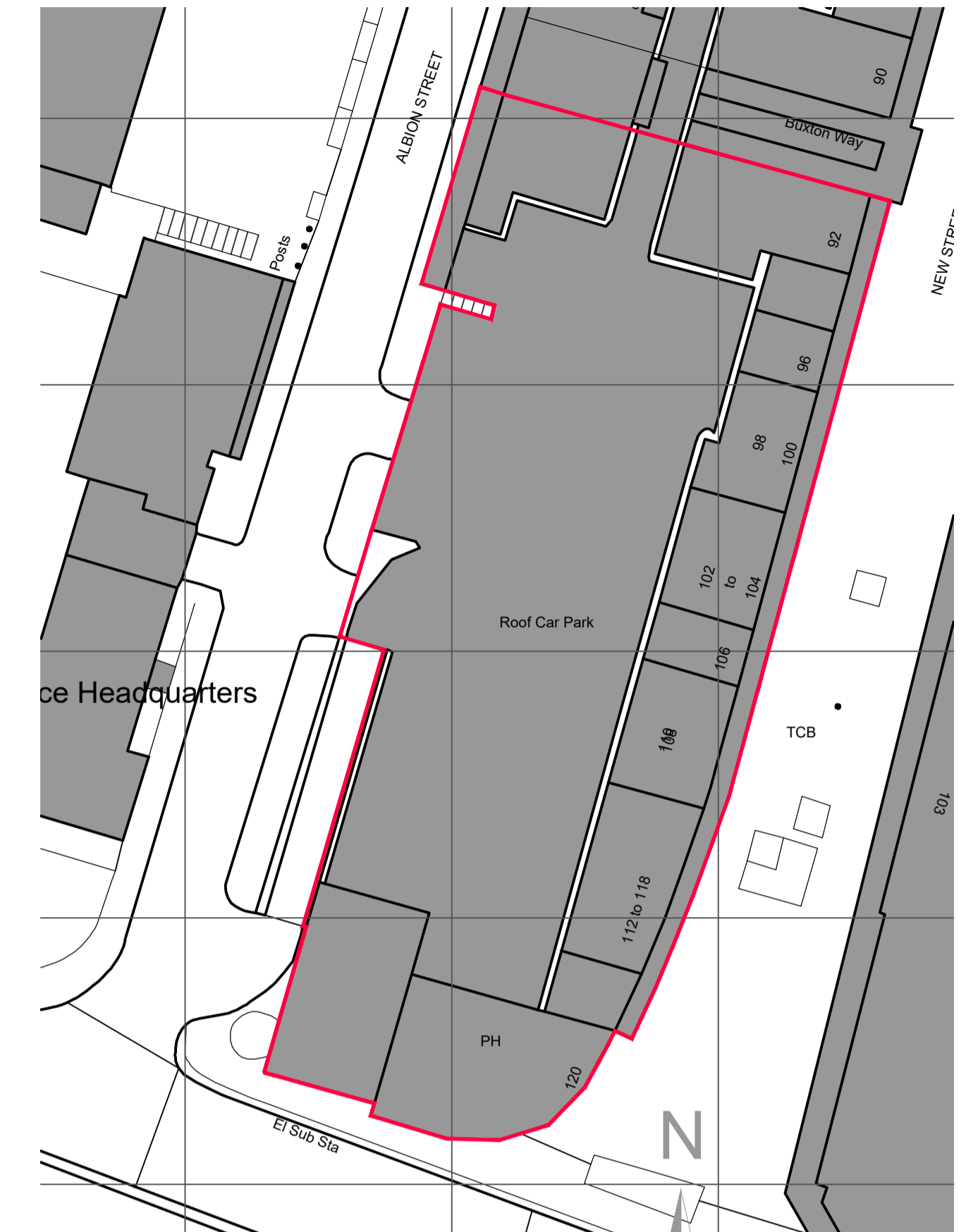
Proposed Site Block Plan 1:500