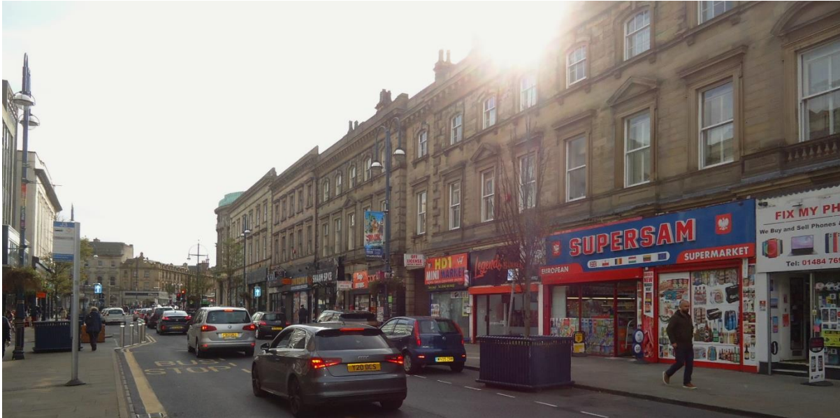
Existing street scene photo of the shop front façade

This Heritage statement has been prepared to support the planning application for the replacement of the shop front, reinstatement and repair works, at 17 - 33a John William Street within Huddersfield Town Centre.