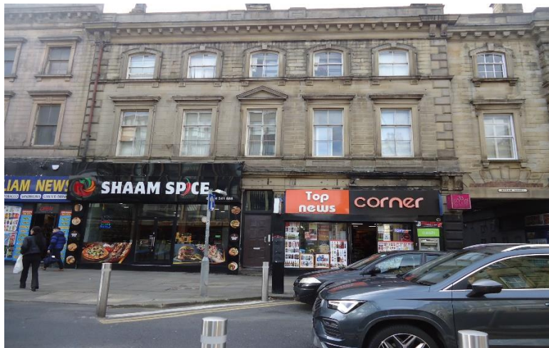
Present-day Photo of John William Street – deterioration of historical features, poor shop front installations and poor signage