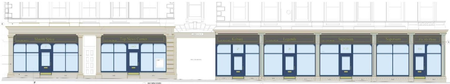
Existing and Proposed Street Scene Elevations