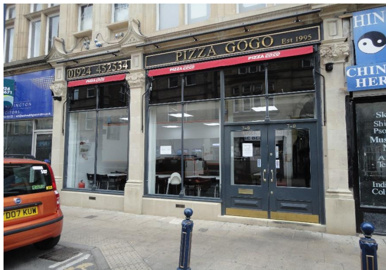
A past example photo of recently successfully completed projects at Corporation Street Dewsbury