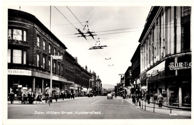
Archive Photo of John William Street c1905